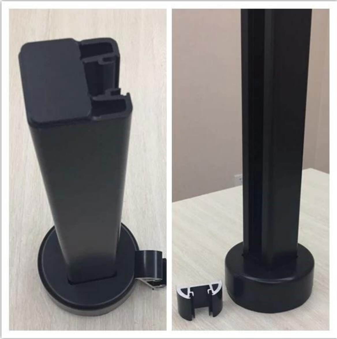
:السلطة المغلقة باللون الأسود - شنت الجانب