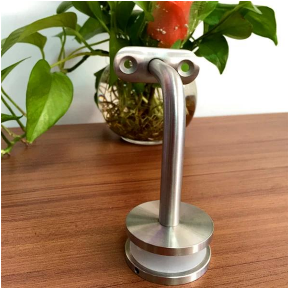
Projektfotos der Halterung für die Glashalterung -