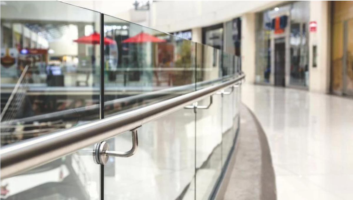
Andere Modelle aus Edelstahl-Handlaufhalterung