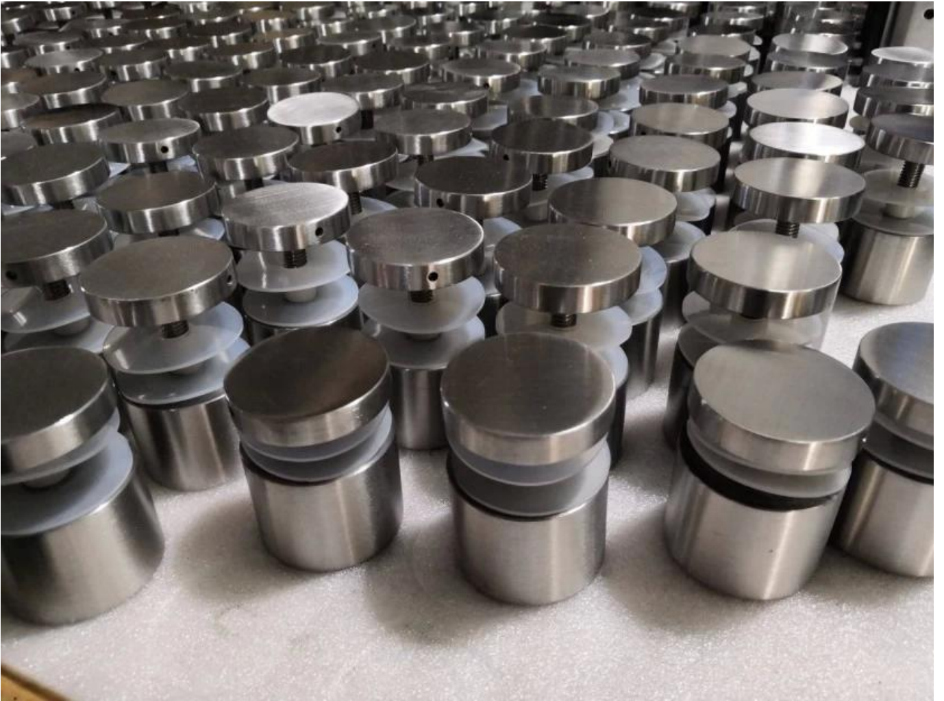
Installation Fotos von Glas-Abstandsgeländern-