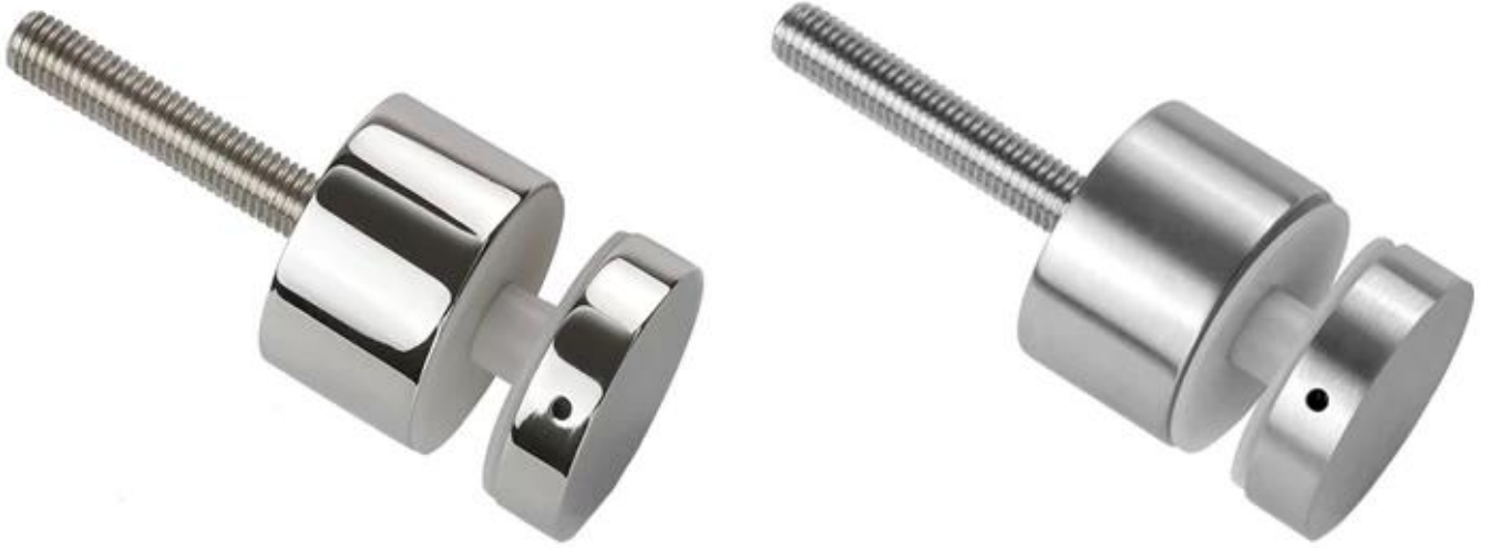
Herstellung und Verpackung Fotos von Glasabstandshaltern -