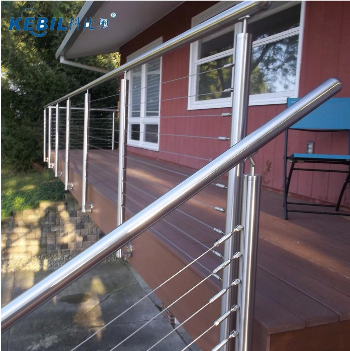
- Innentreppe Design Edelstahl Drahtseil Geländer