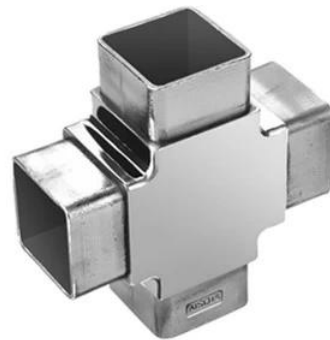
Projektfotos von Handlauf-Rohrverschraubungen