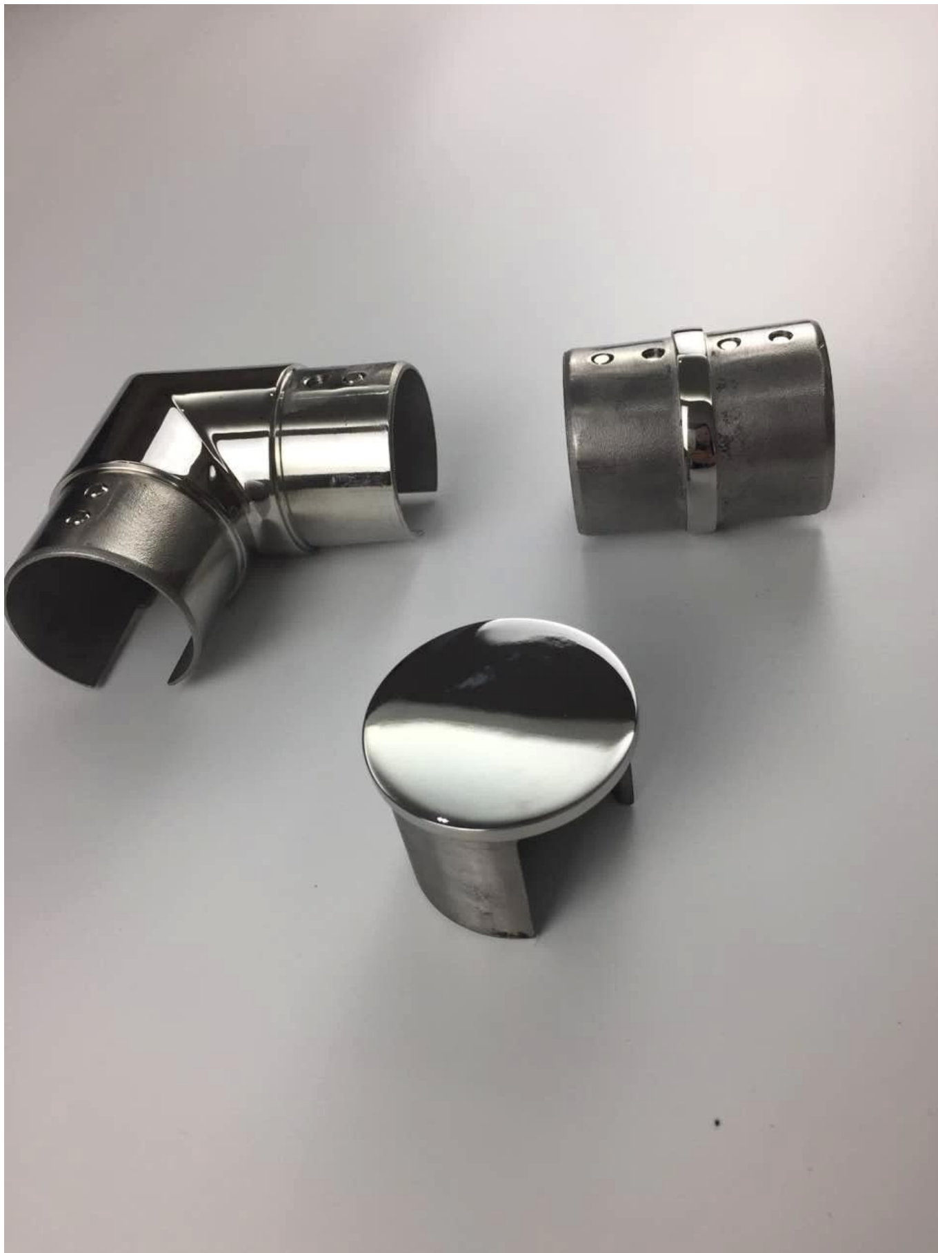
# detalles del embalaje para el kit de pasamanos con tapa de acero inoxidable