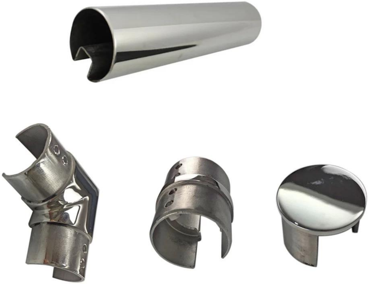
Conector de 180 grados para el tubo de la baranda, vista desde abajo