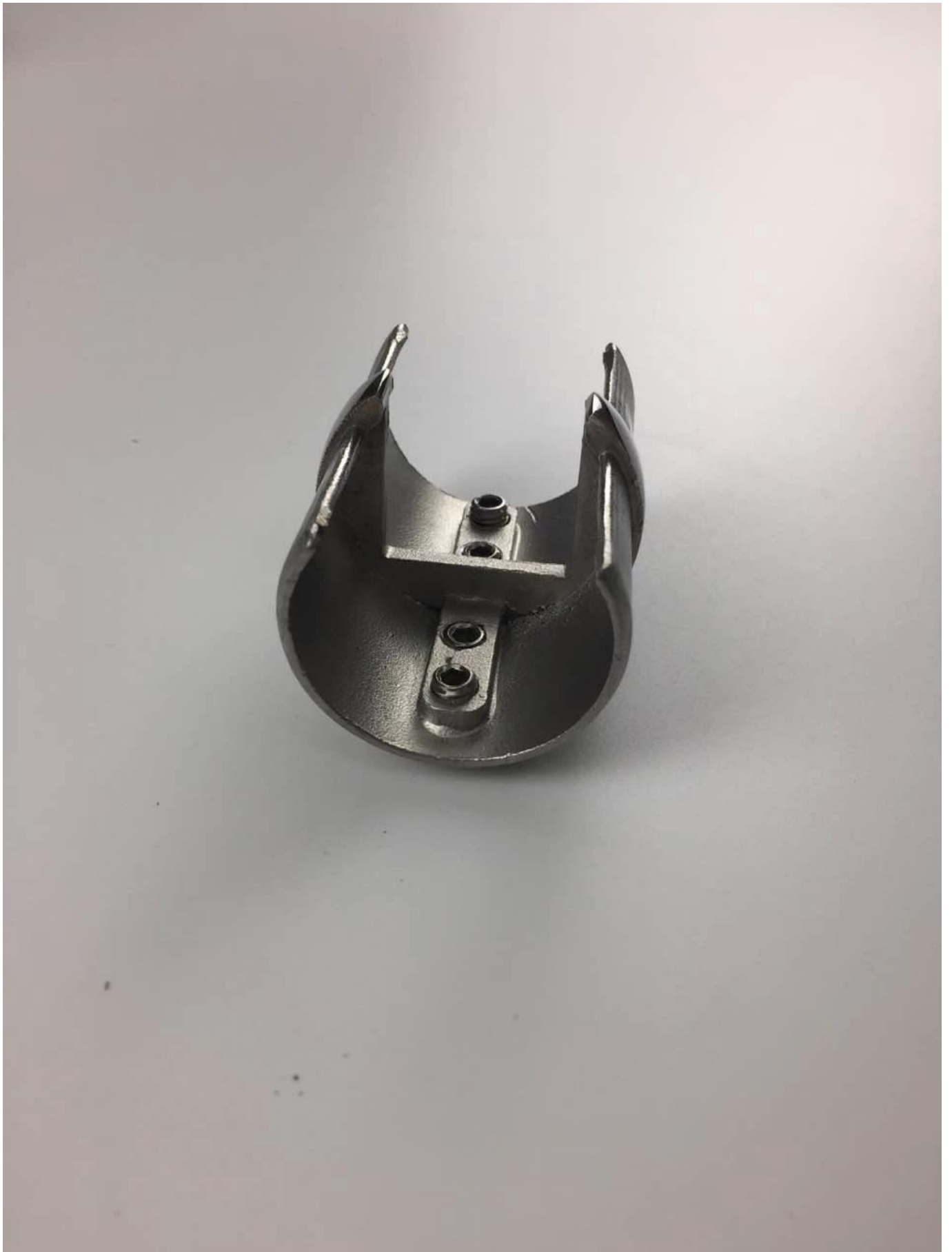
Conector de 180 grados para el tubo de la barandilla, vista desde arriba