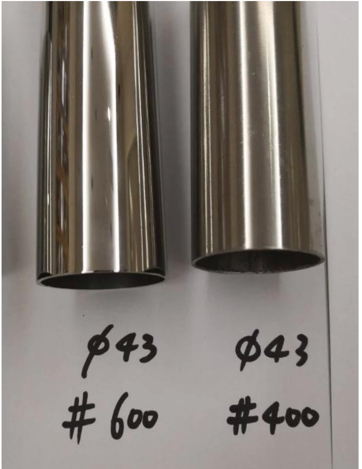
3. Fotos de producción para tubo de barandilla de acero inoxidable.