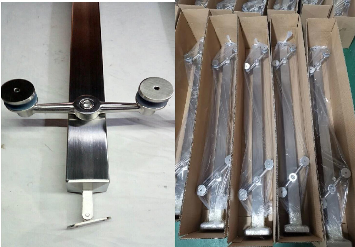
Fotos de proyecto de pasamanos de accesorios de vidrio de araña