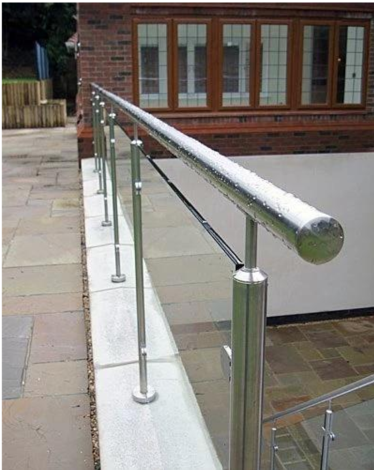
Pasamanos de acero inoxidable para balcones exteriores / puentes / barandillas Terrance Design: