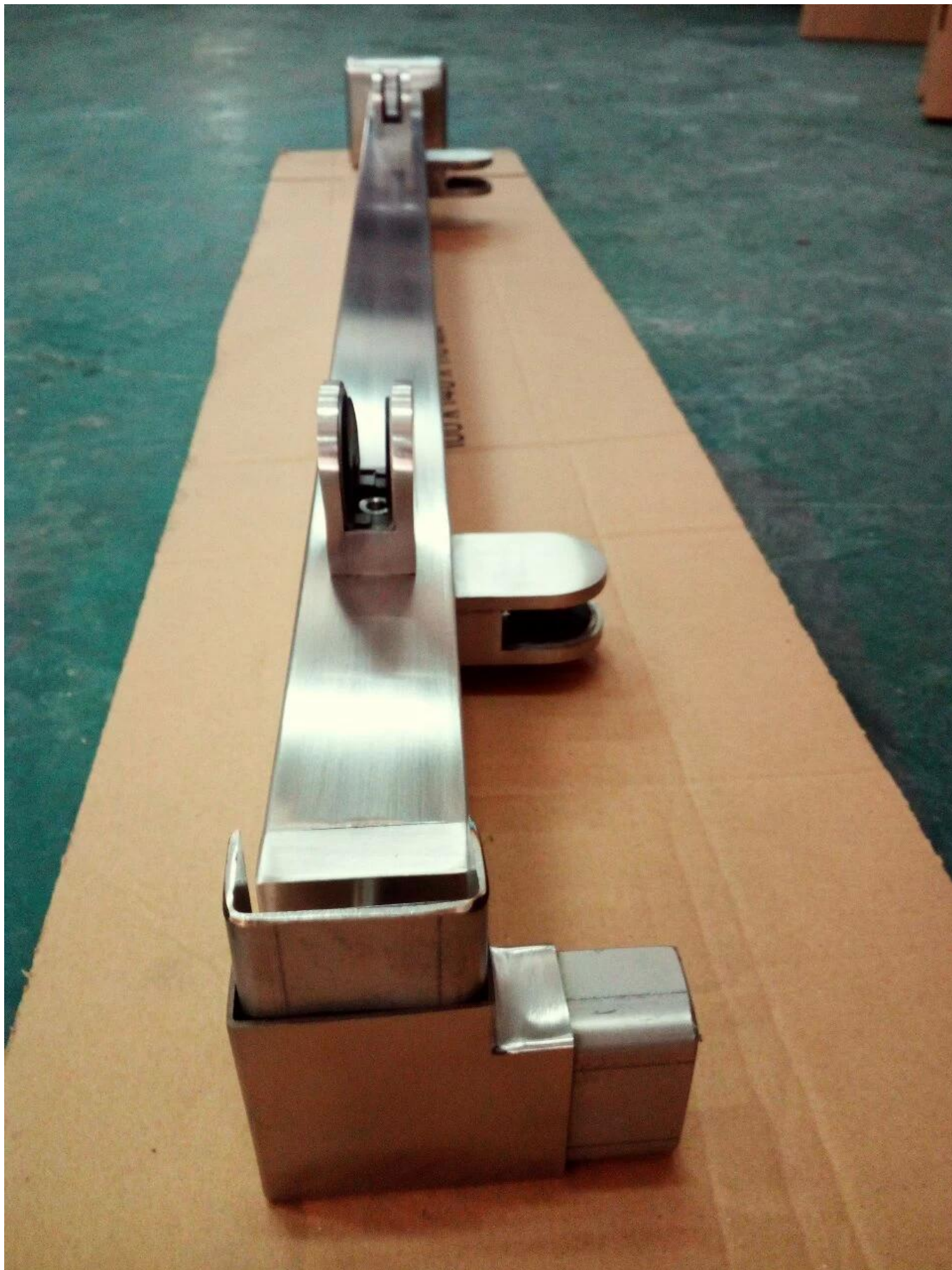
Detalles de la compañía -