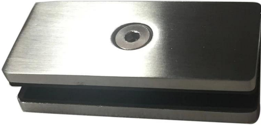
lasipuristin, 10-12 mm lasi