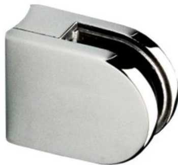
Erilaiset näkymät ruostumattomasta teräksestä valmistetulle lasipuristimelle G104R