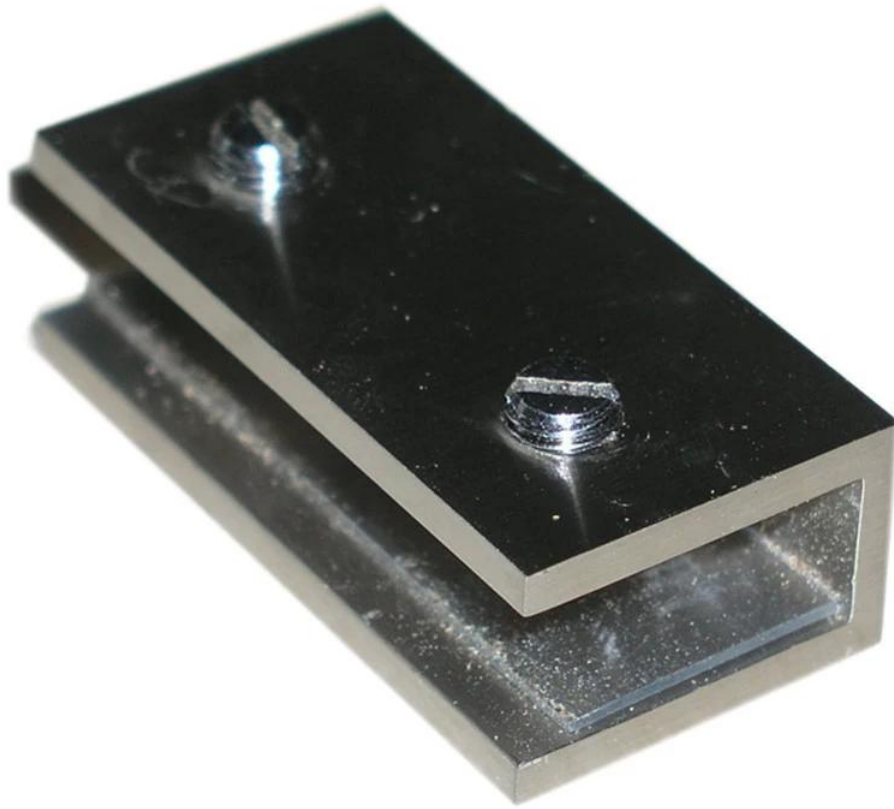
Lasin puristimen projektikuvat -