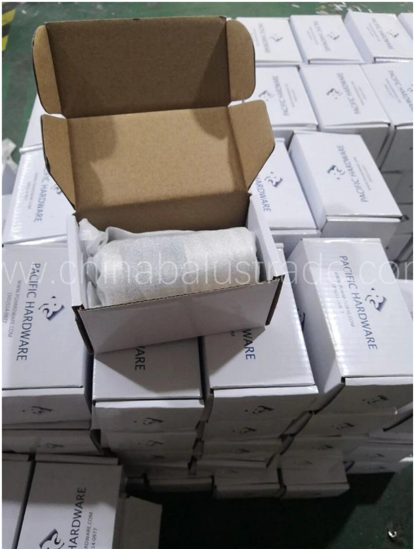
Projektikuvat harjattua ruostumattomasta teräksestä valmistetuista CRL-lasi-rautatie-eristeistä