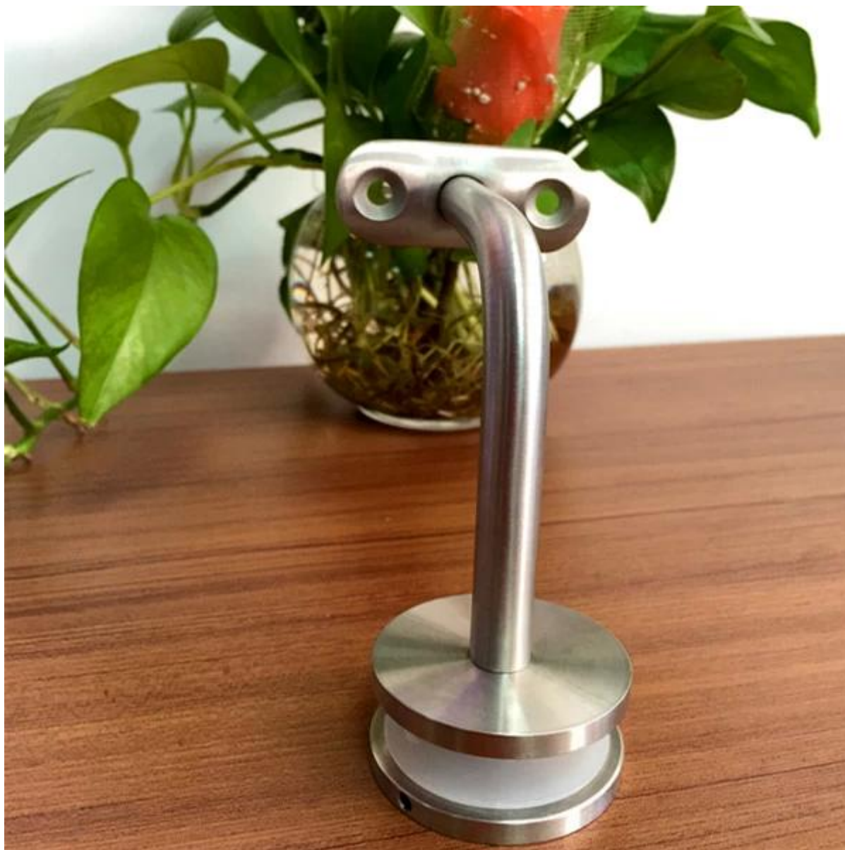
Photos de projet de support de main courante en verre -