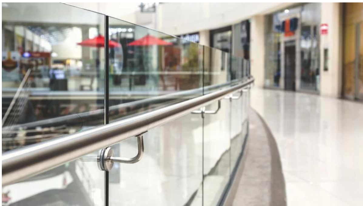
Autres modèles de support de main courante en acier inoxydable