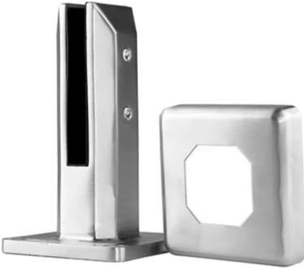
4. projet photo en acier inoxydable carré en verre spigot