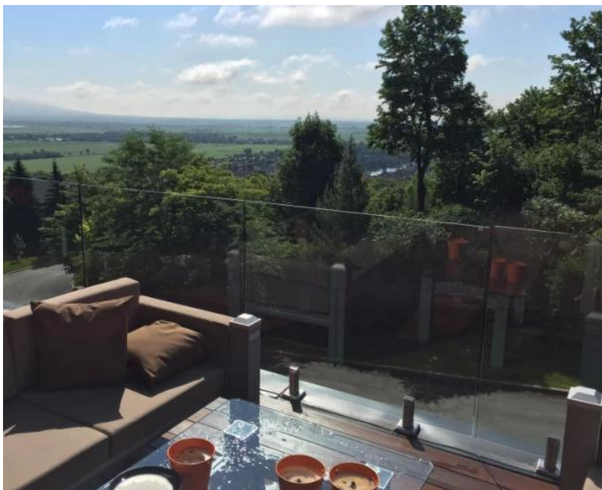
Shenzhen Launch Co., Ltd est une fabrication professionnelle avec la conception, la production et la vente de matériel en acier inoxydable, raccords de rampes de verre,