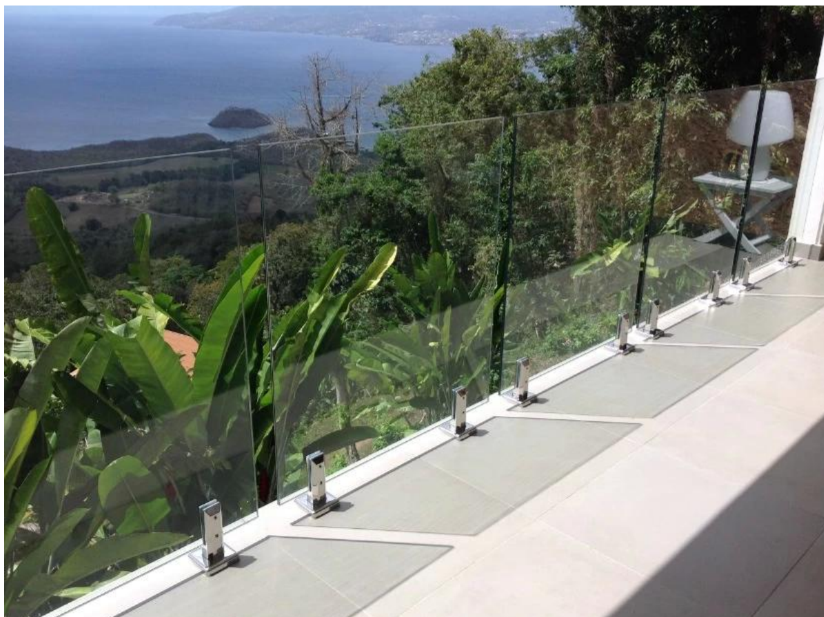
SBM en finition satinée: