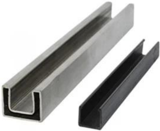
square top rail