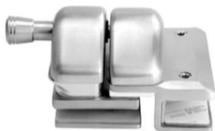
Glass to glass latch 180 degree