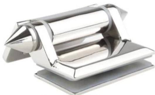
Glass to wall hinge