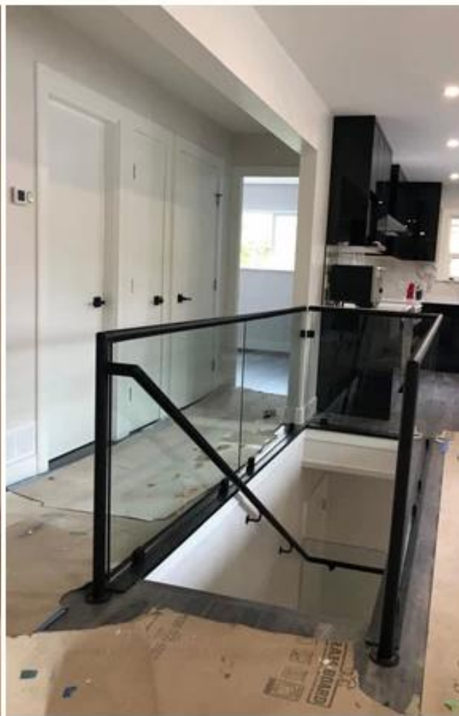
Foto di progetti di vetro standoff