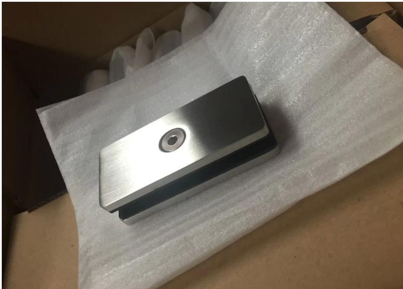
Foto di progetto per morsetto di vetro da 180 gradi