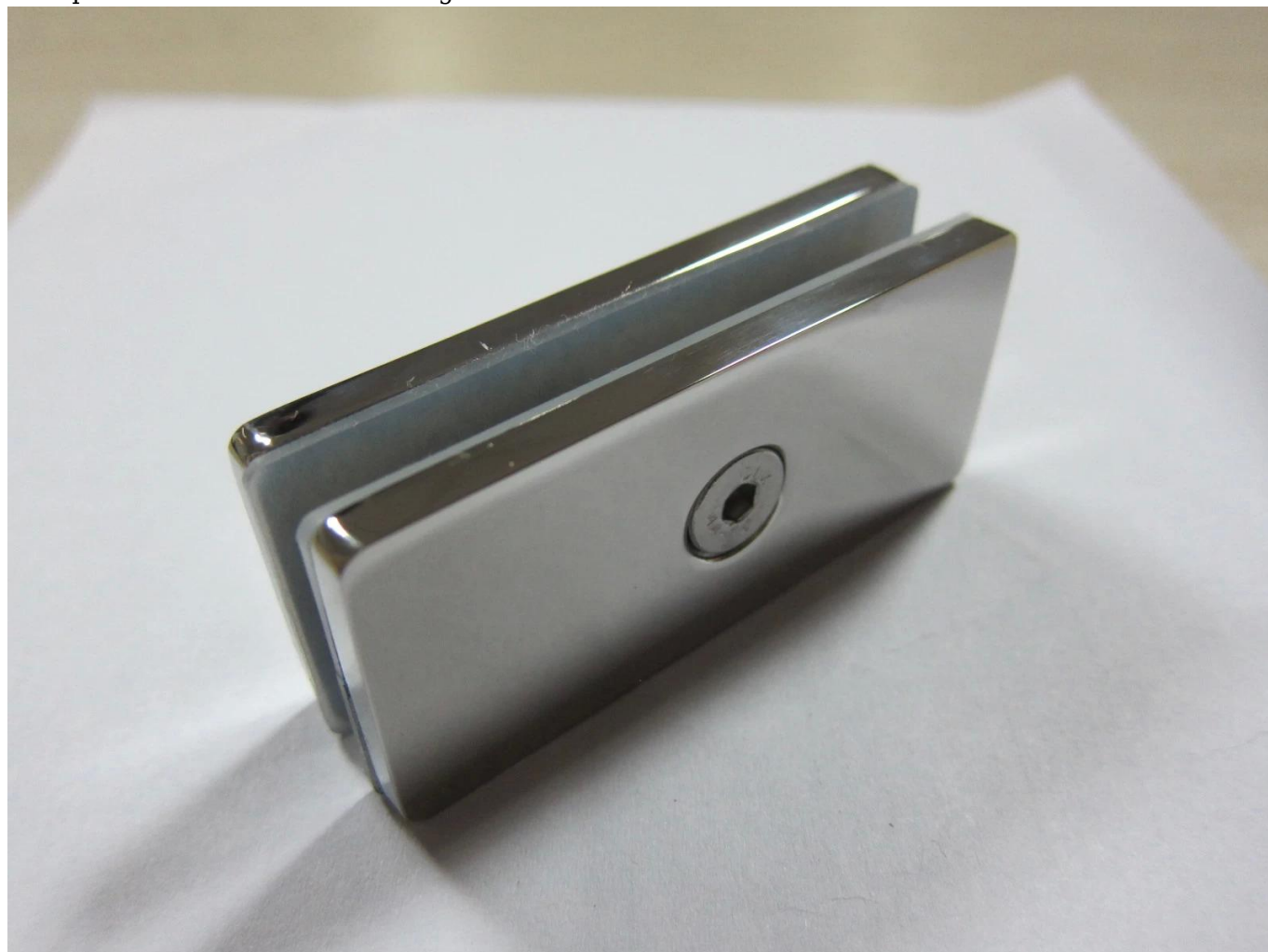
Foto per morsetto in vetro da 180 gradi -