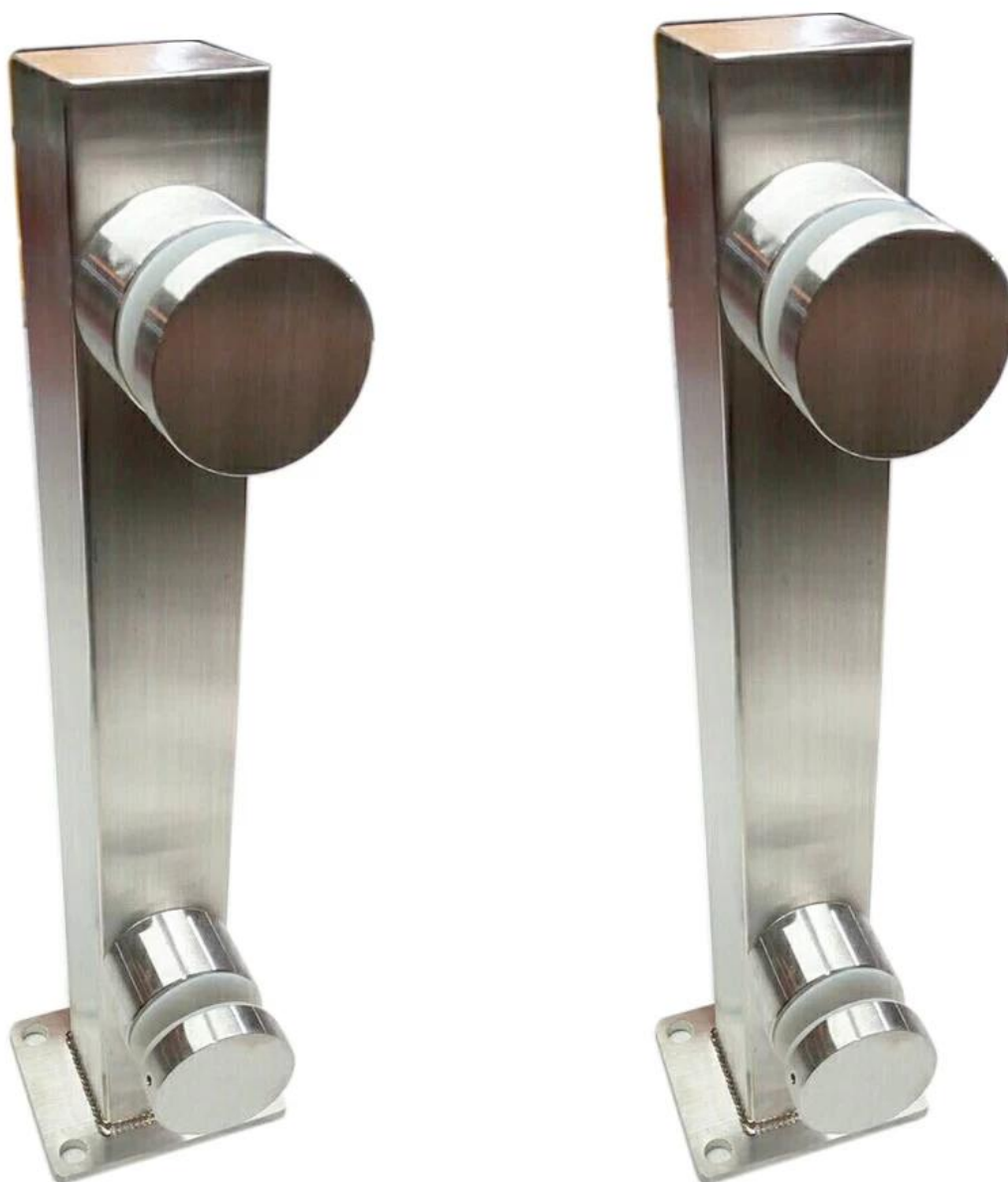
Foto per balaustra post -