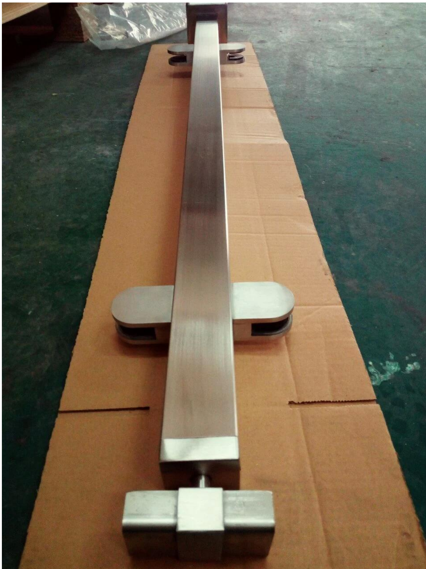
postazione di ringhiera di vetro quadrata