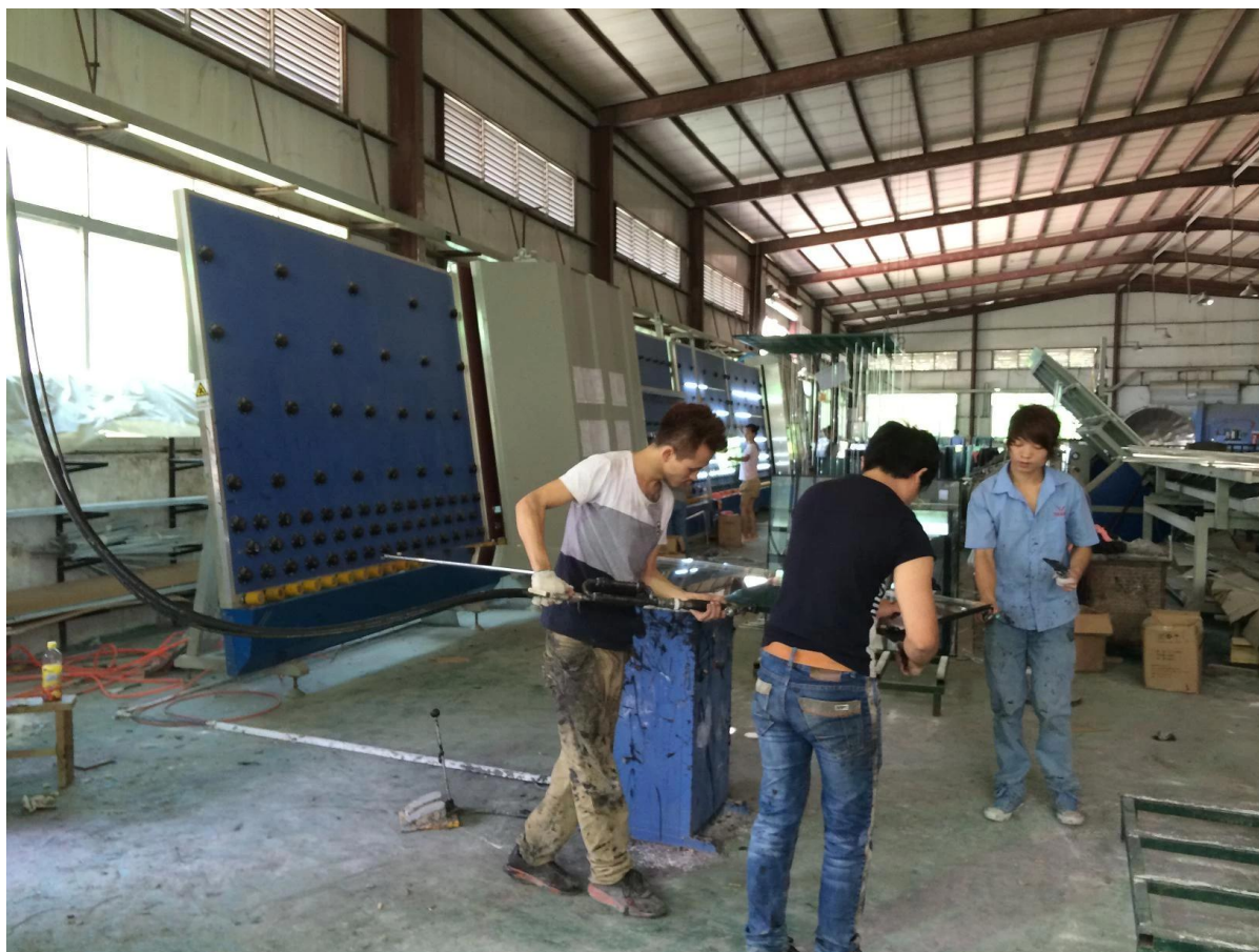
Opakowanie & Dostawa