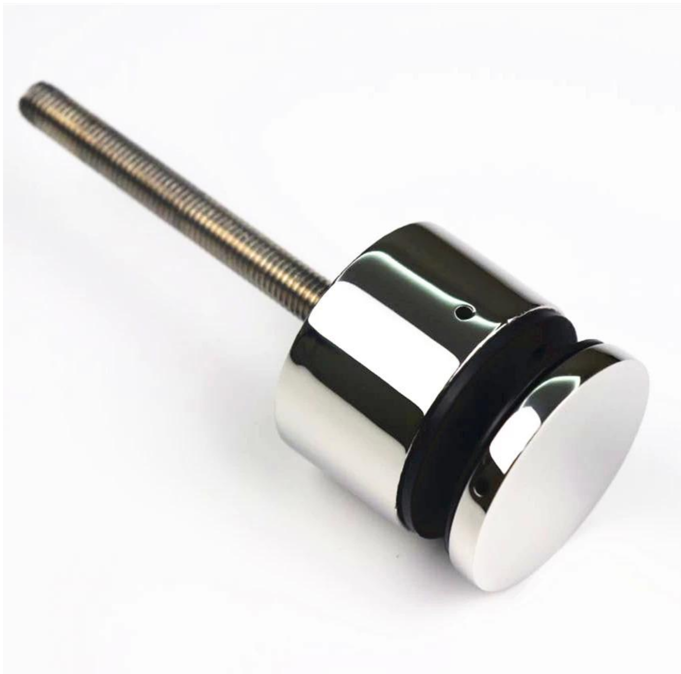
Zdjęcia produkcyjne ze szczotkowanej stali nierdzewnej CRL łączniki dystansowe ze szkła szynowego