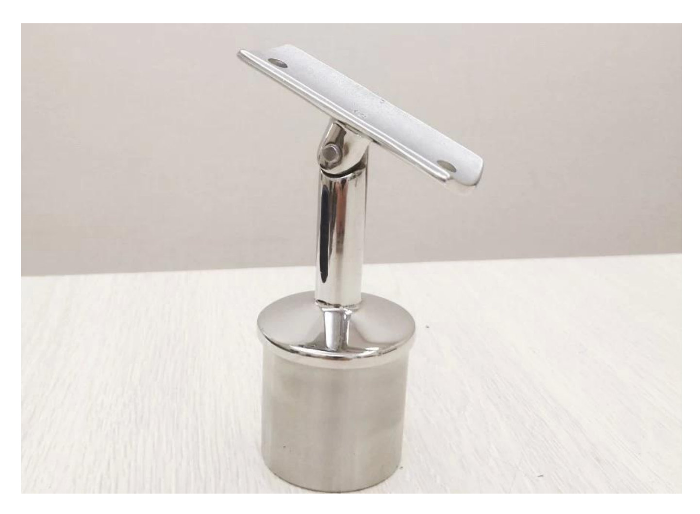
# Installation photos of stainless steel post handrail bracket