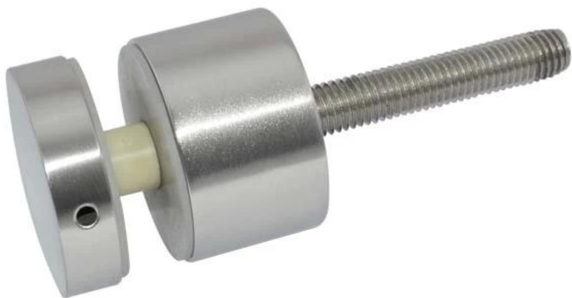
photo of glass standoff bracket wood mount