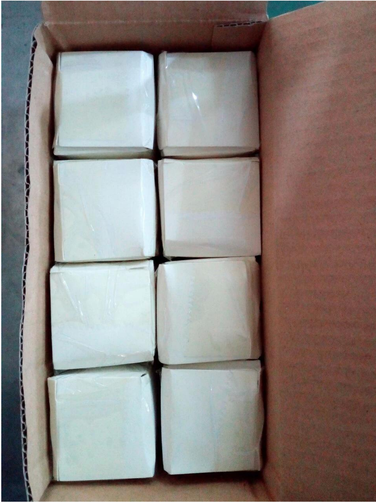
Project photo for glass railing standoff .