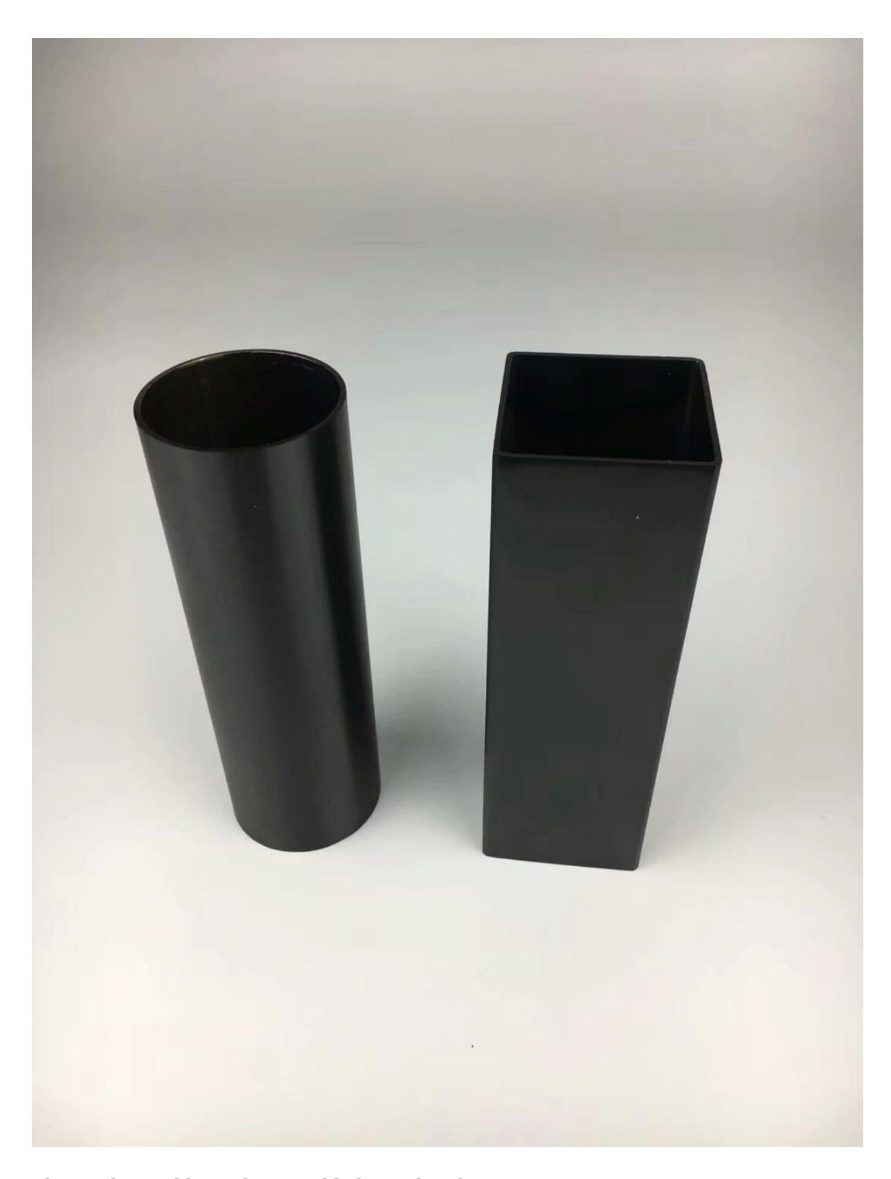
Electroplate gold stainless steel balustrade tube pipe