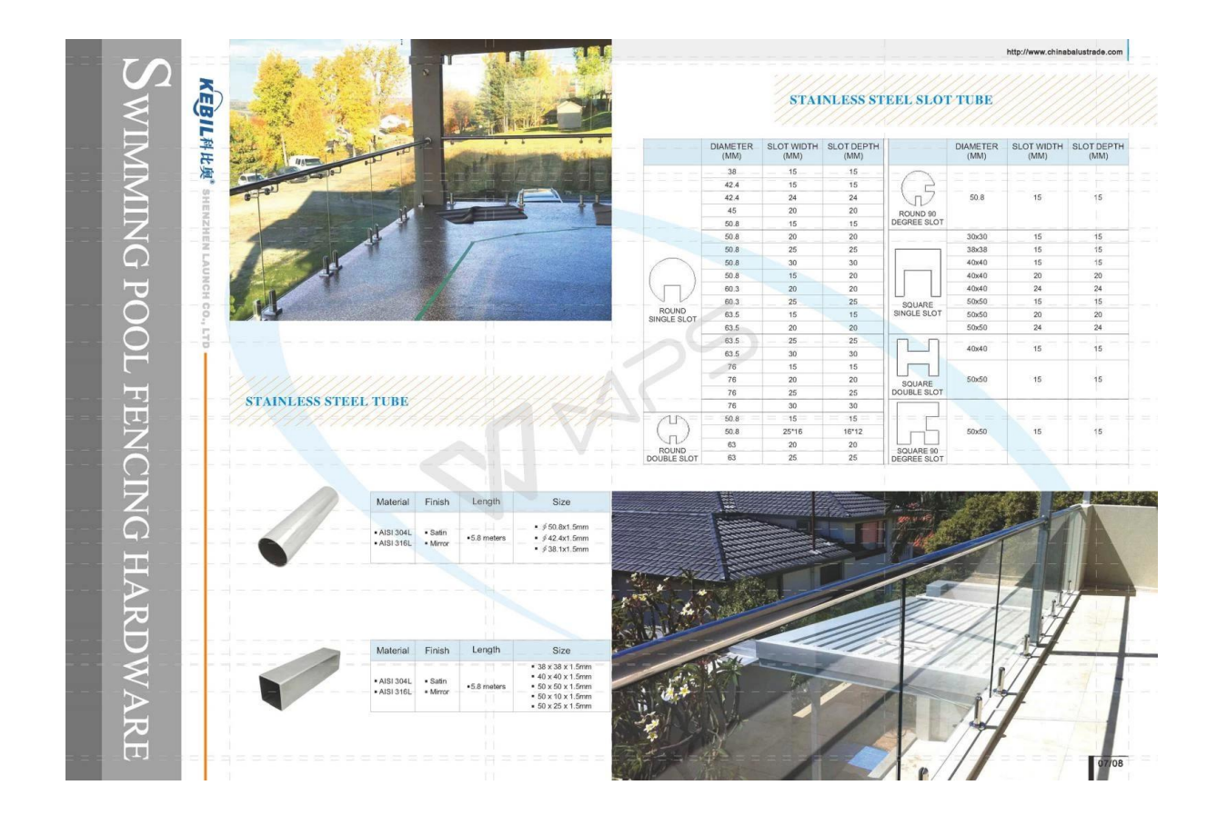
Electroplate black stainless steel balustrade tube pipe