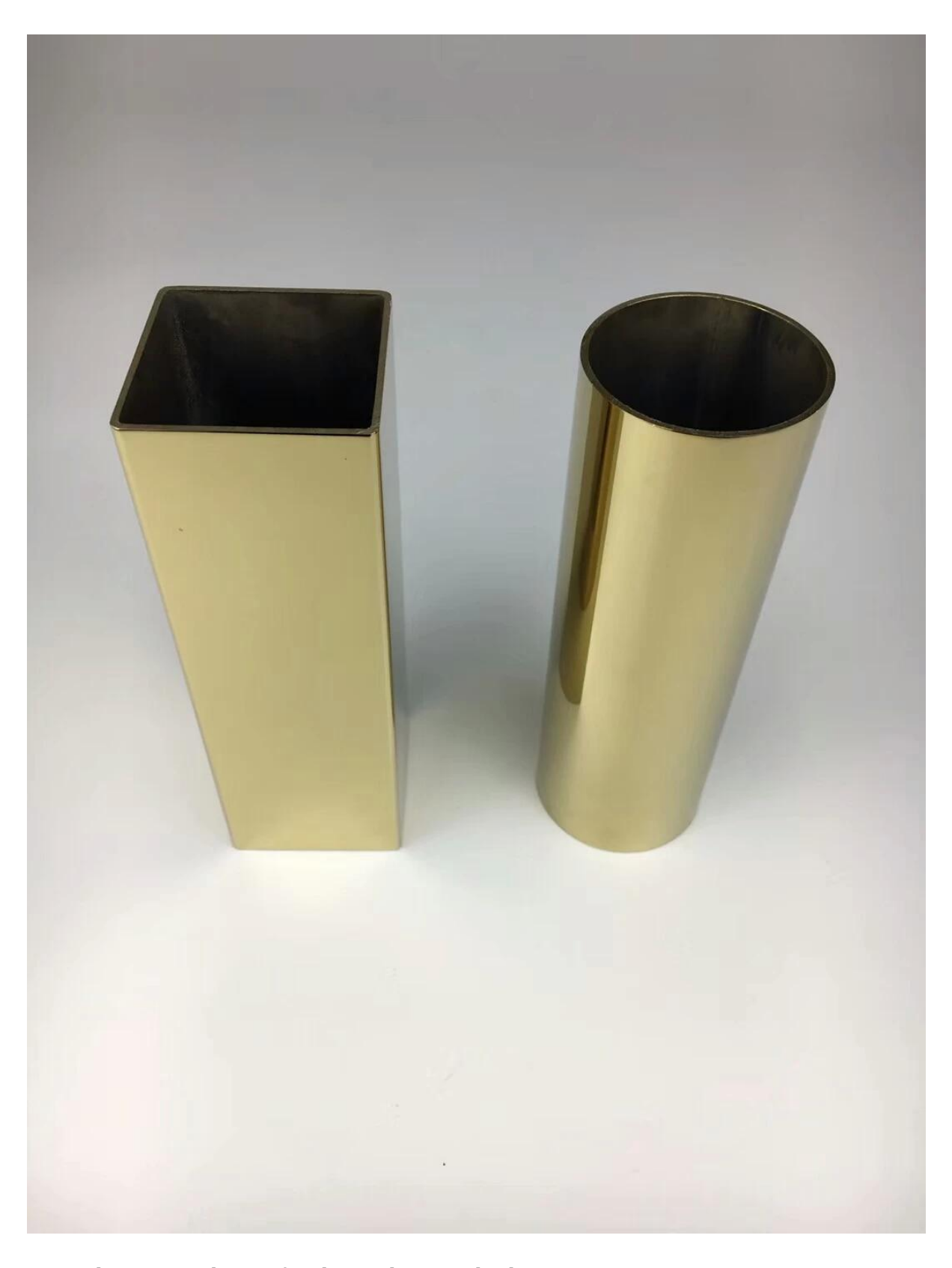
Normal mirror and satin finish stainless steel tube pipe