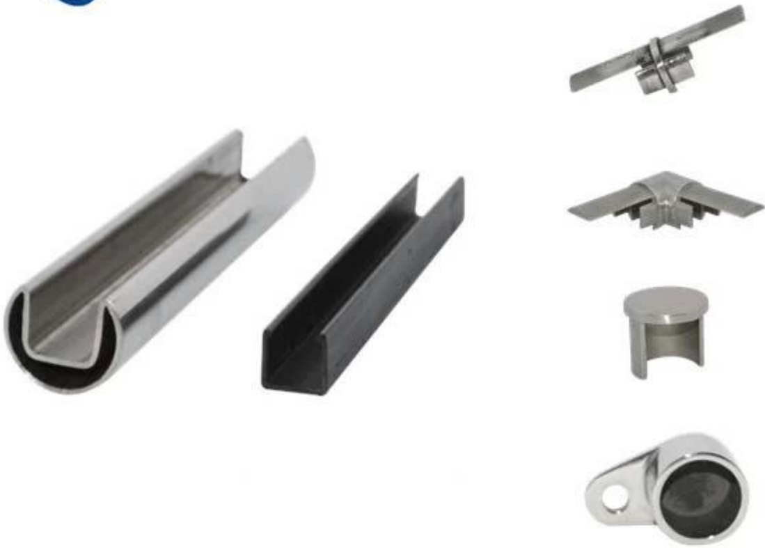
3. Packing photos for 316L stainless steel capping rail handrail tube