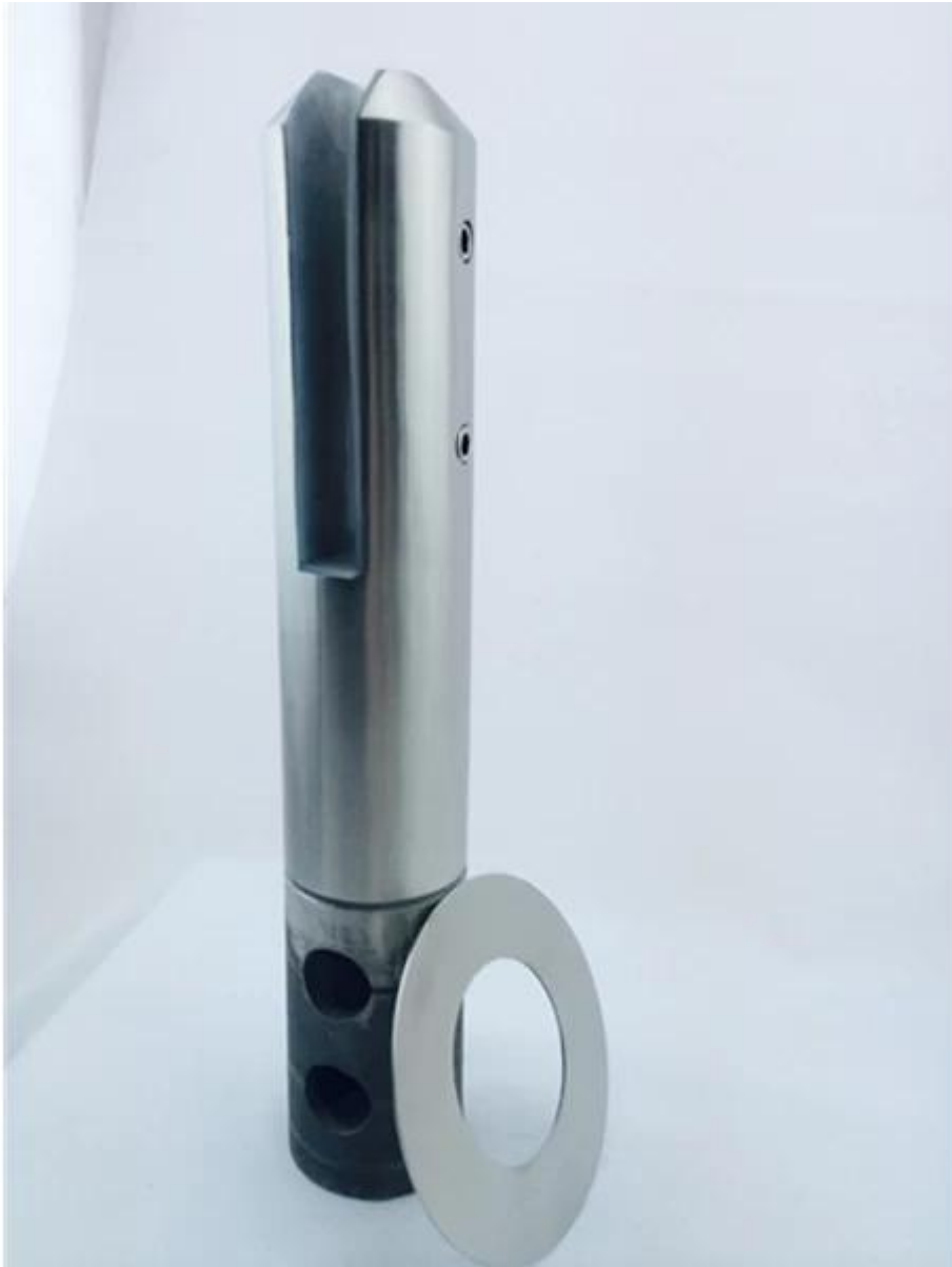
Project in Australia