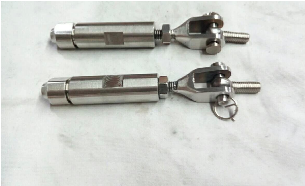
2) Cable fitting T803 dimension