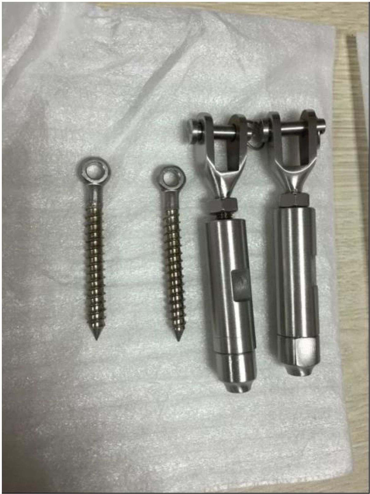
Cable fitting T803 with bolt fixing into steel post.