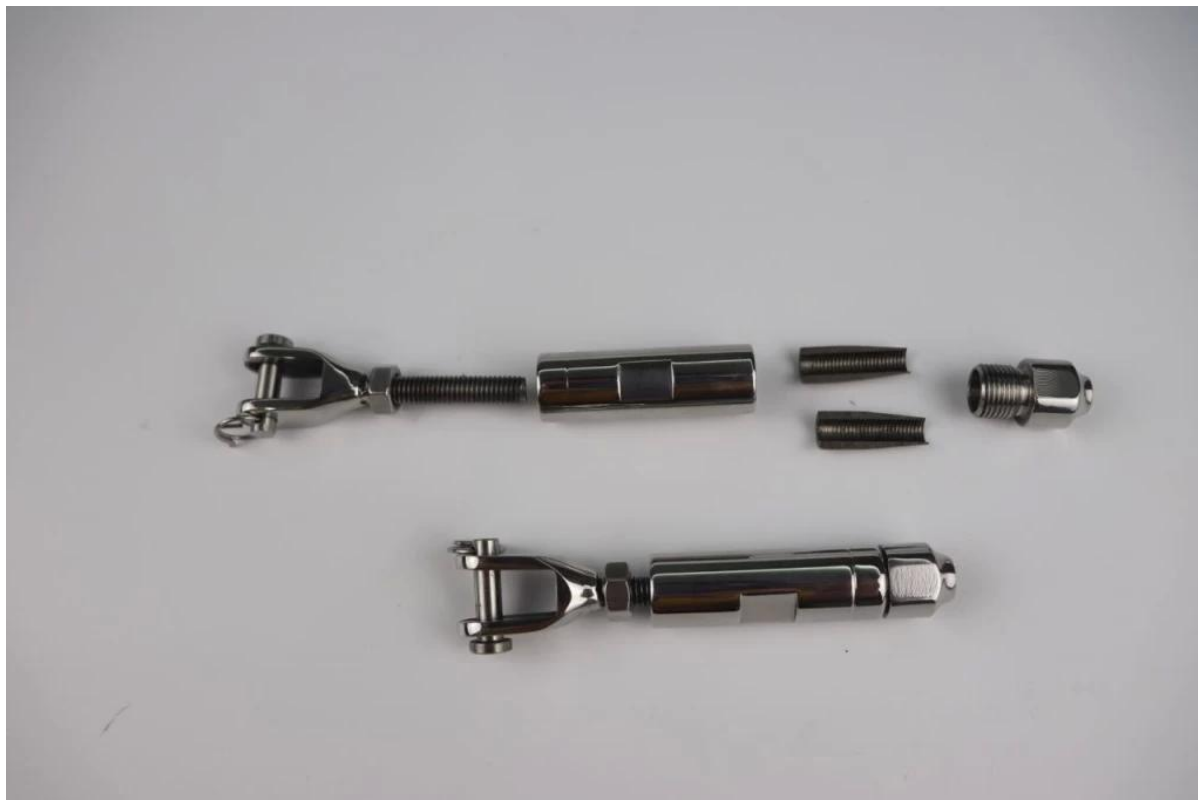
Cable fitting T803 with screw fixing into timber