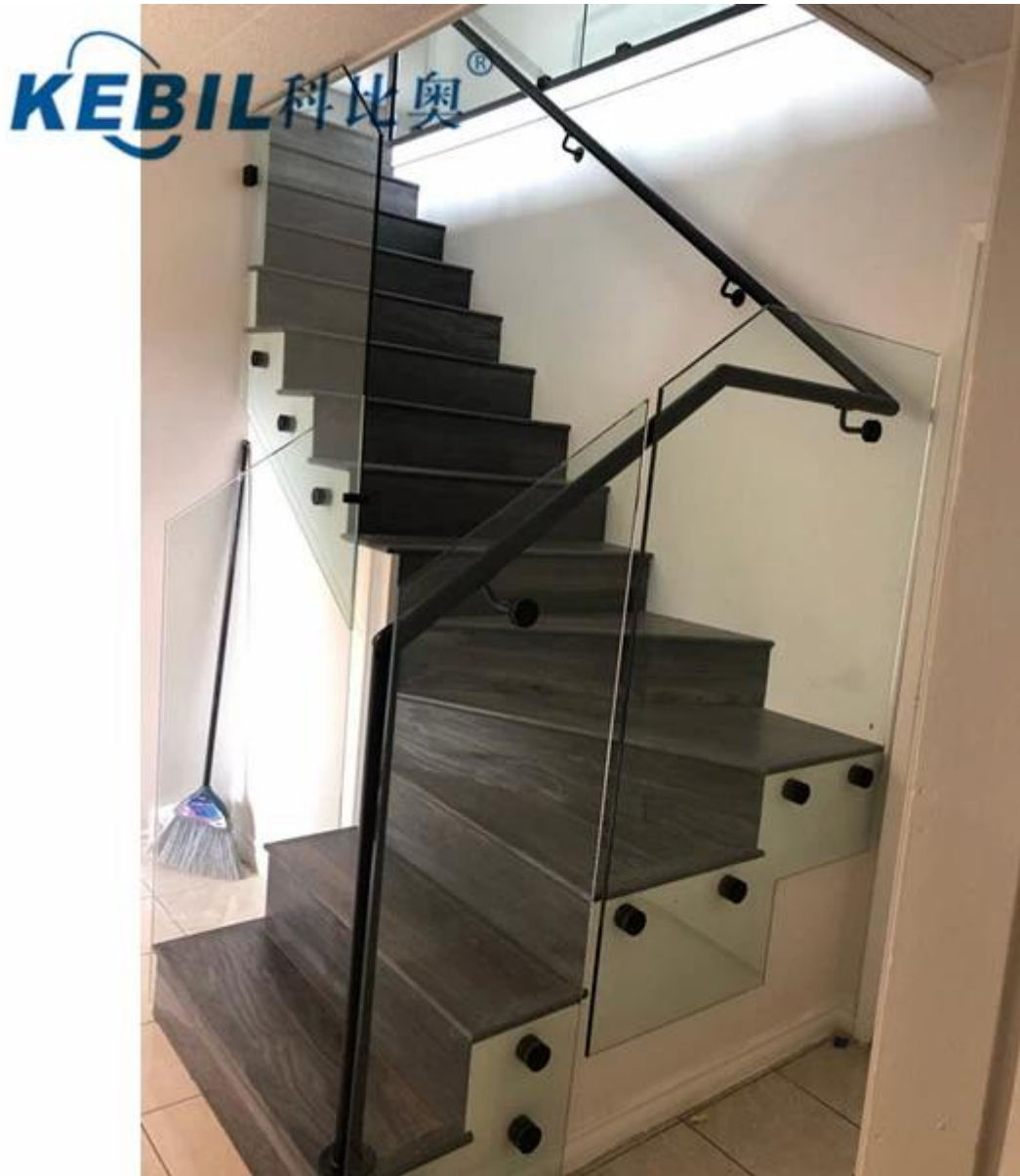
Adjustable Glass Standoff Project Photos