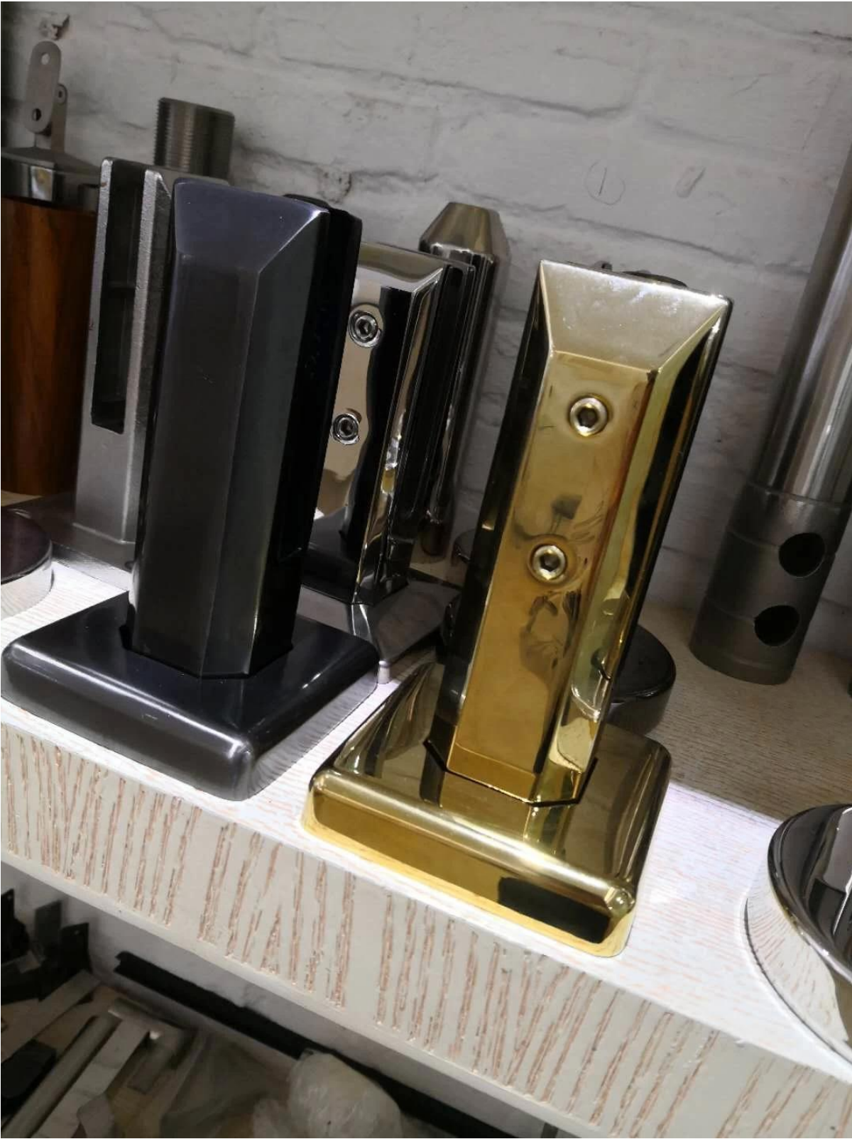
3). Drawing for Black color stainless steel pool fence spigot , SBM