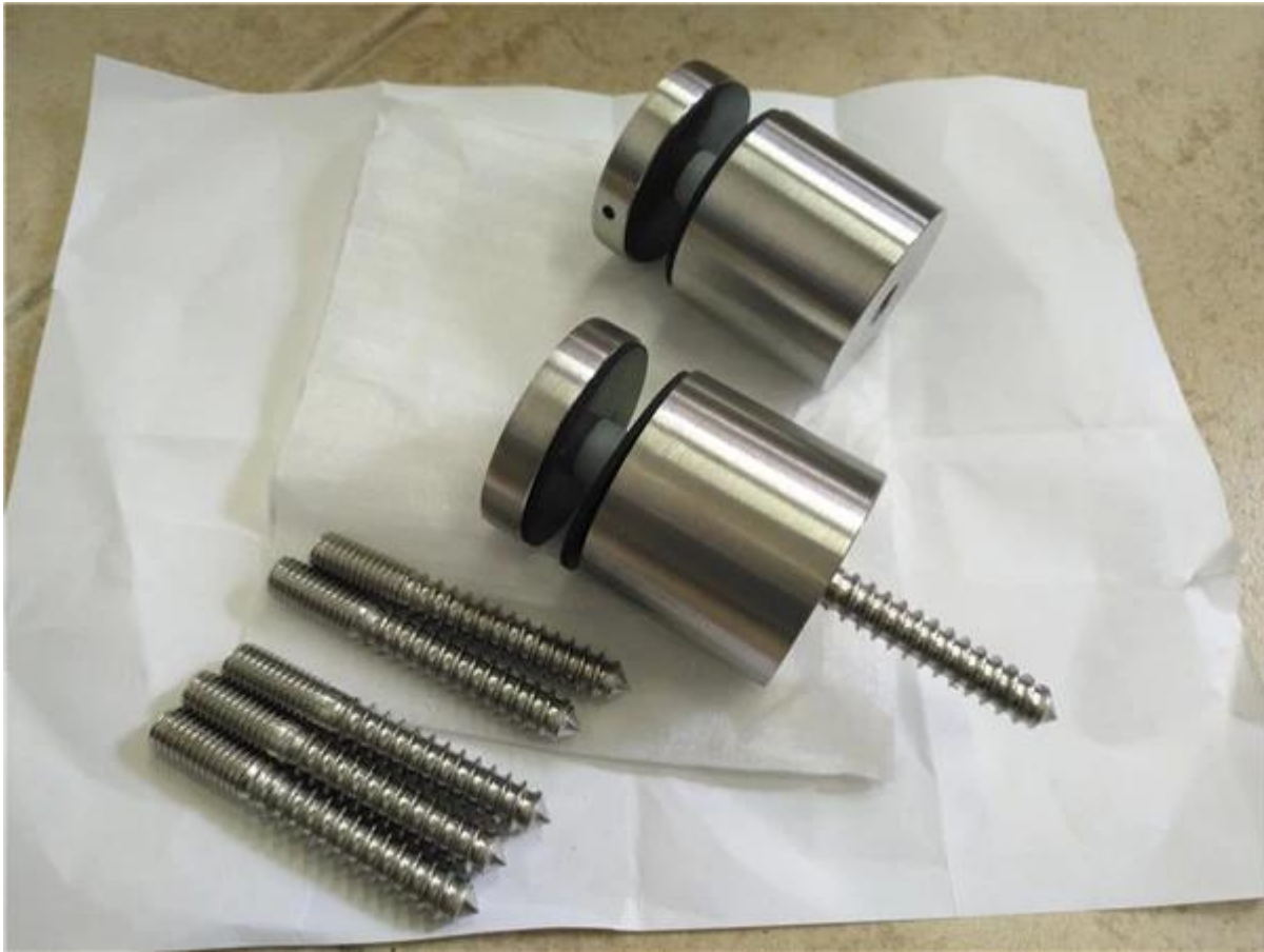
Back section Screw in separately packaging :