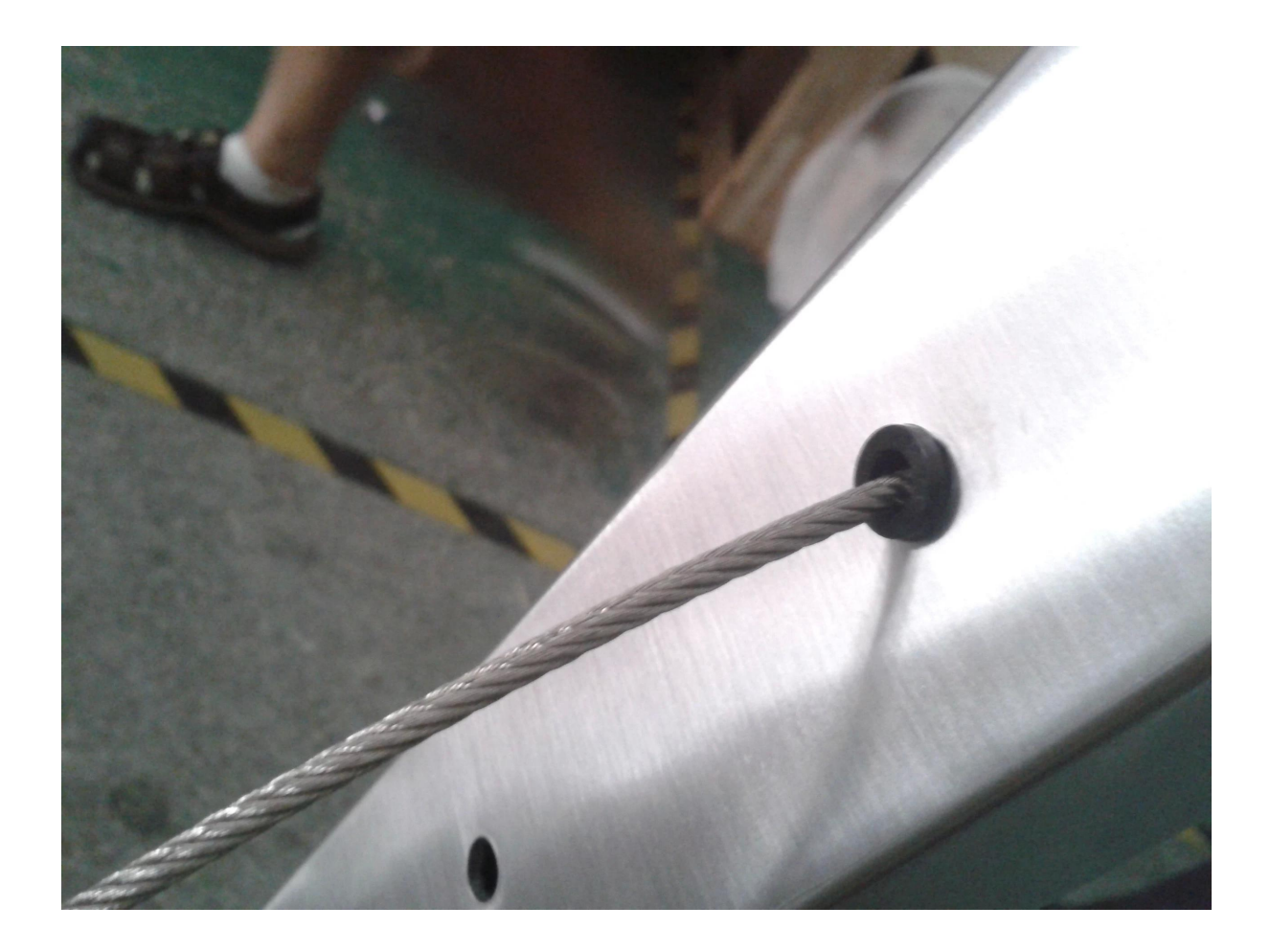
Stainless steel post base cover (100x100mm)