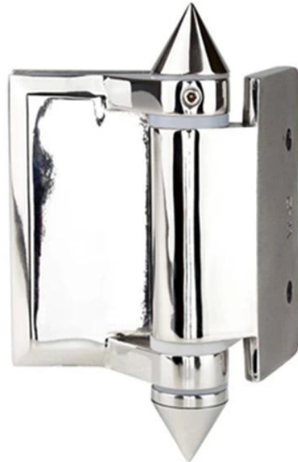
3. Glass to round post hinghe