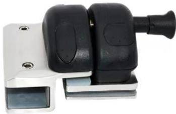
MODEL # GL-180