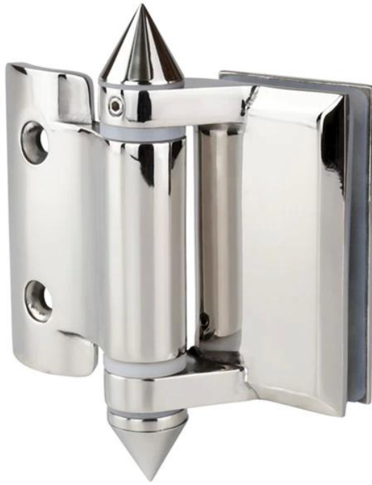
Packing photo of glass hinge-