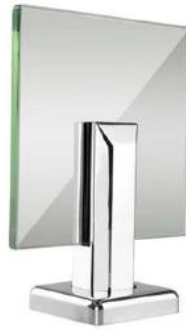
Square base plate spigot , model# SBM-2