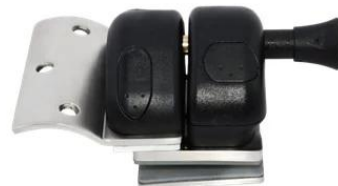
MODEL # GL-R