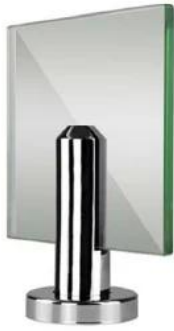
Round base plate spigot , model# RBM-2