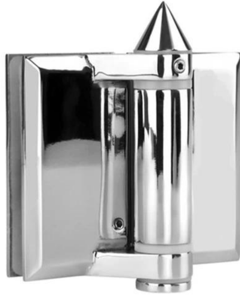
2. Glass to wall/square post hinge