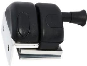
MODEL # GL-W