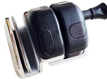
MODEL # GL-90