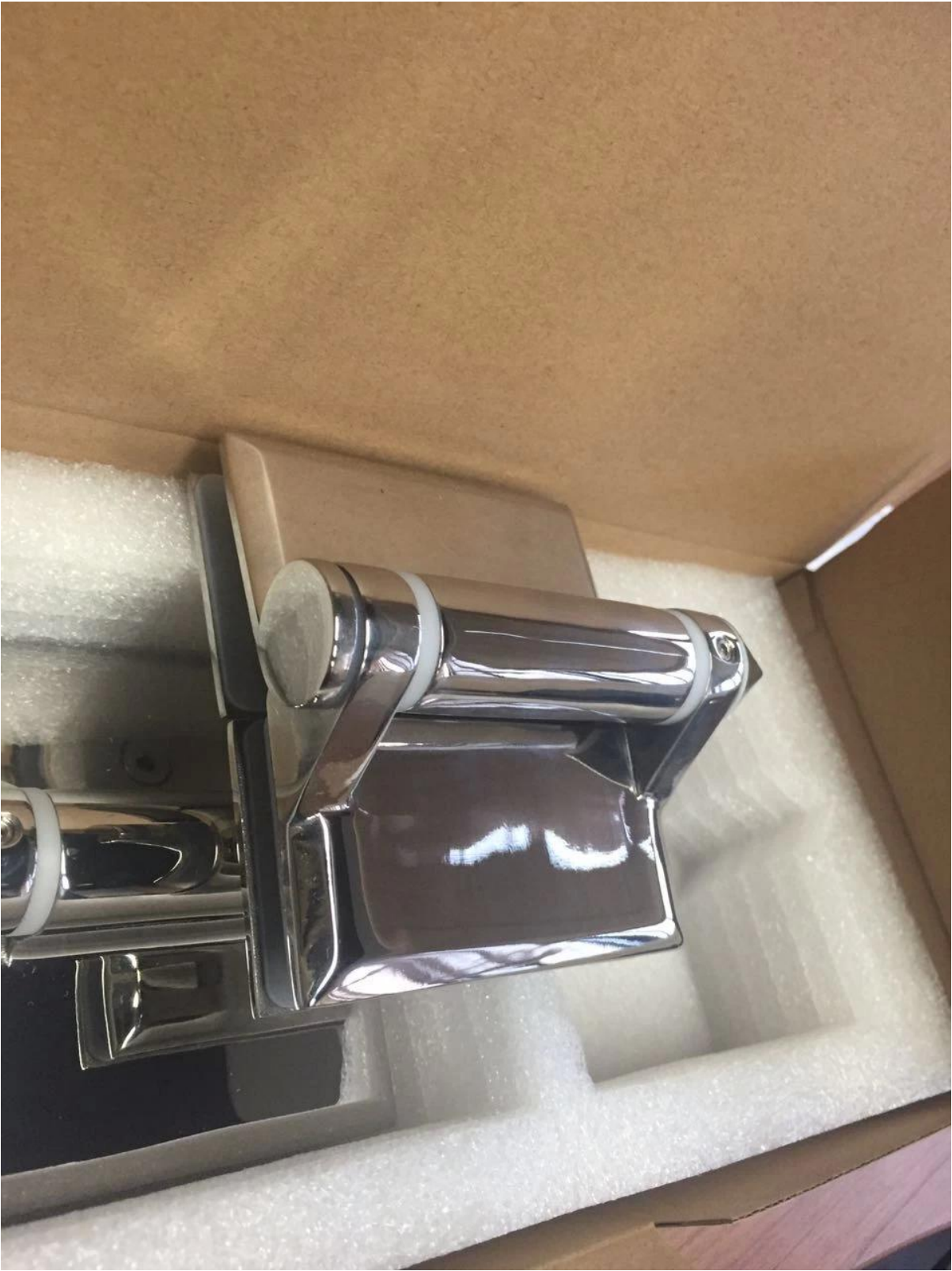
Project photos of glass hinge-