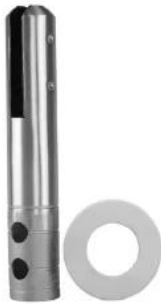
Round core drill glass spigot , model # RCM-2