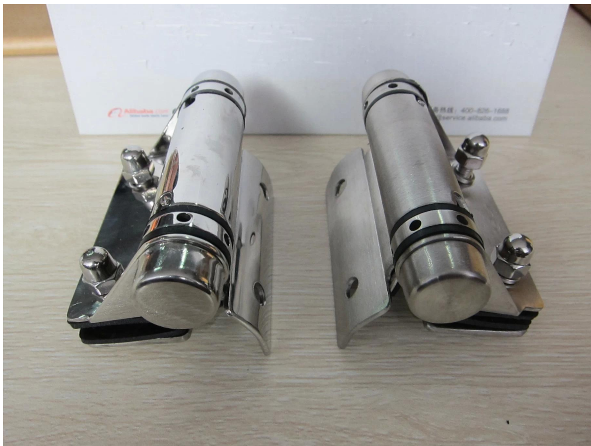
Glass to square post/wall hinge G-W1