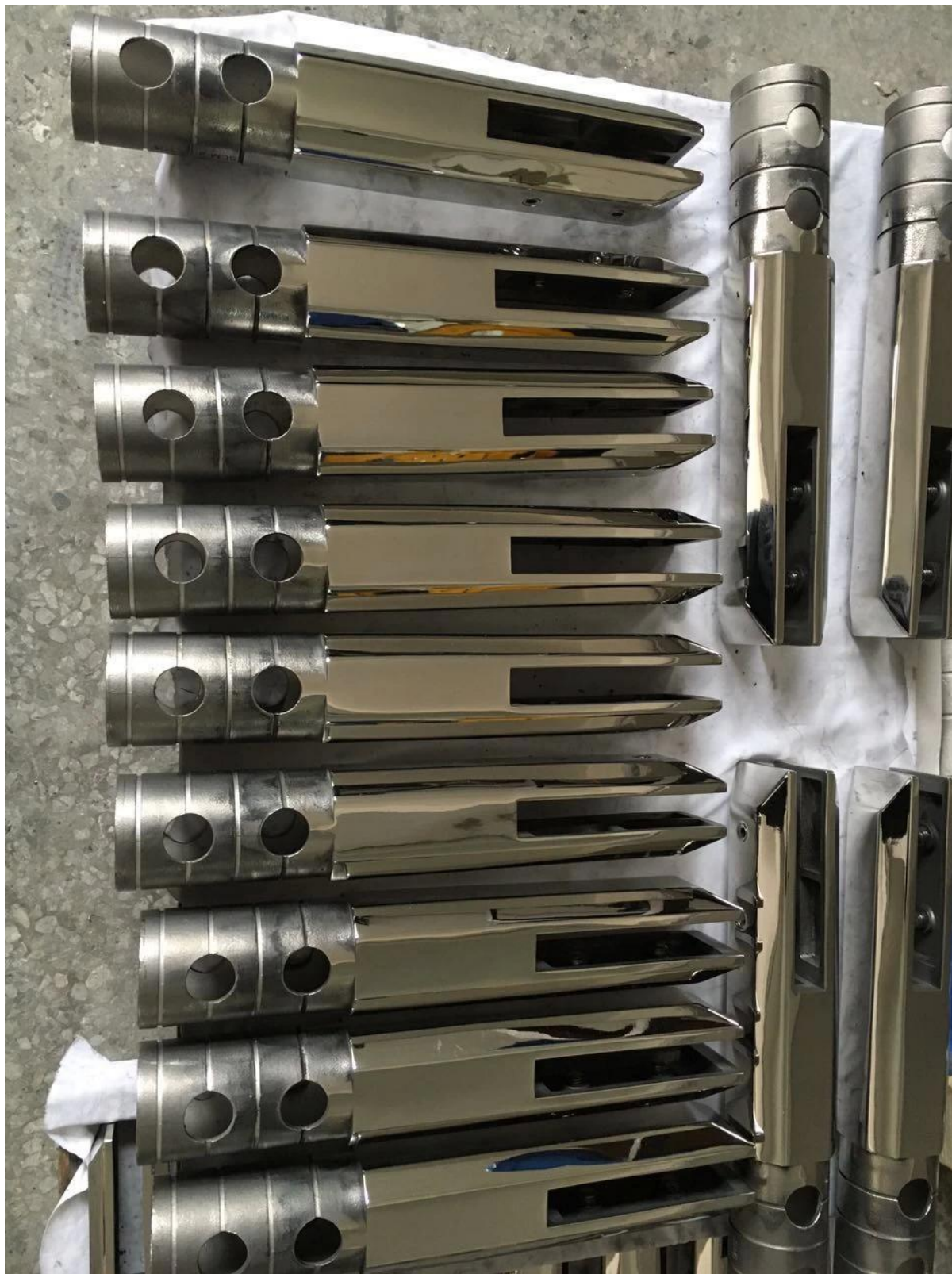
3) Glass spigot factory