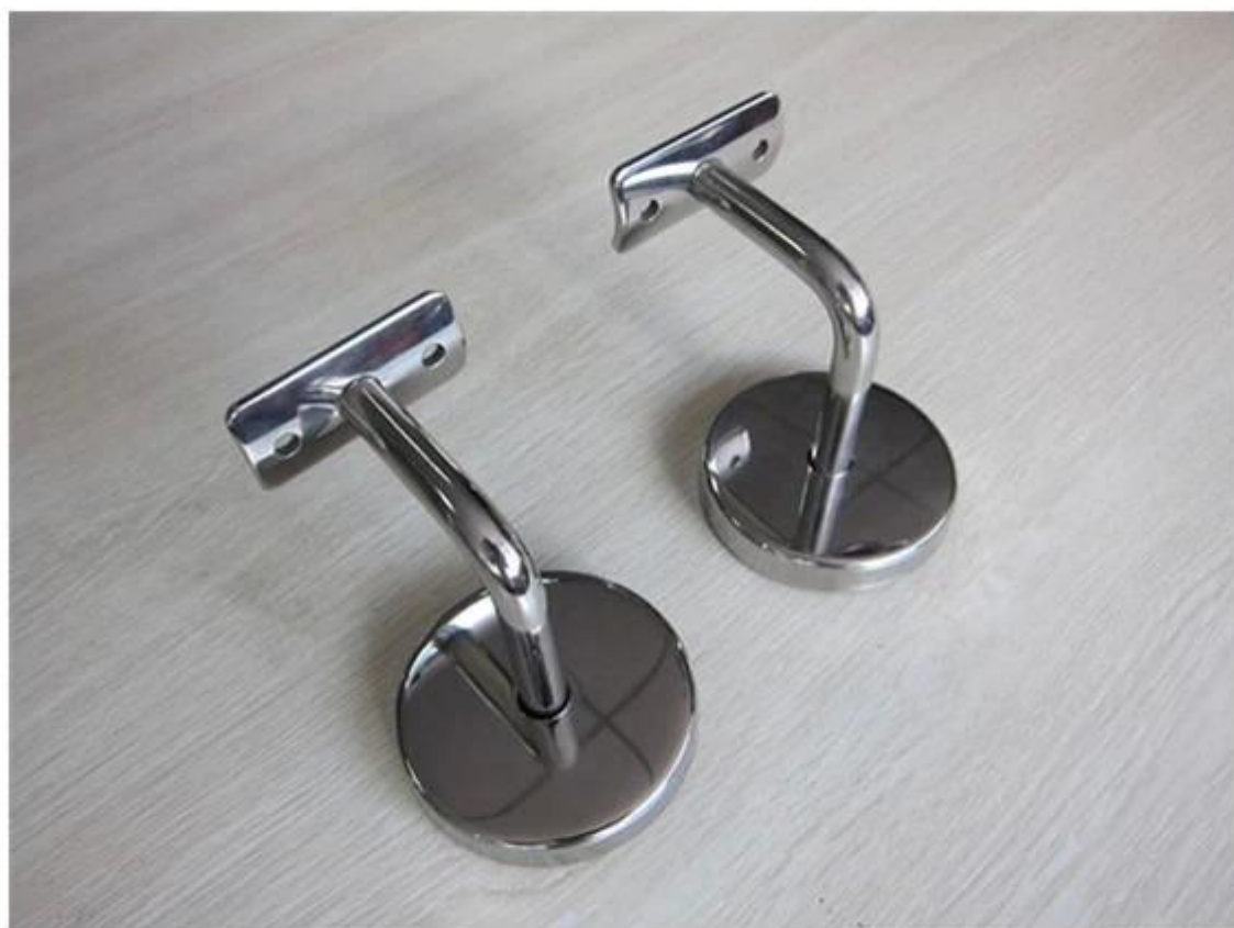
handrail bracket P703R