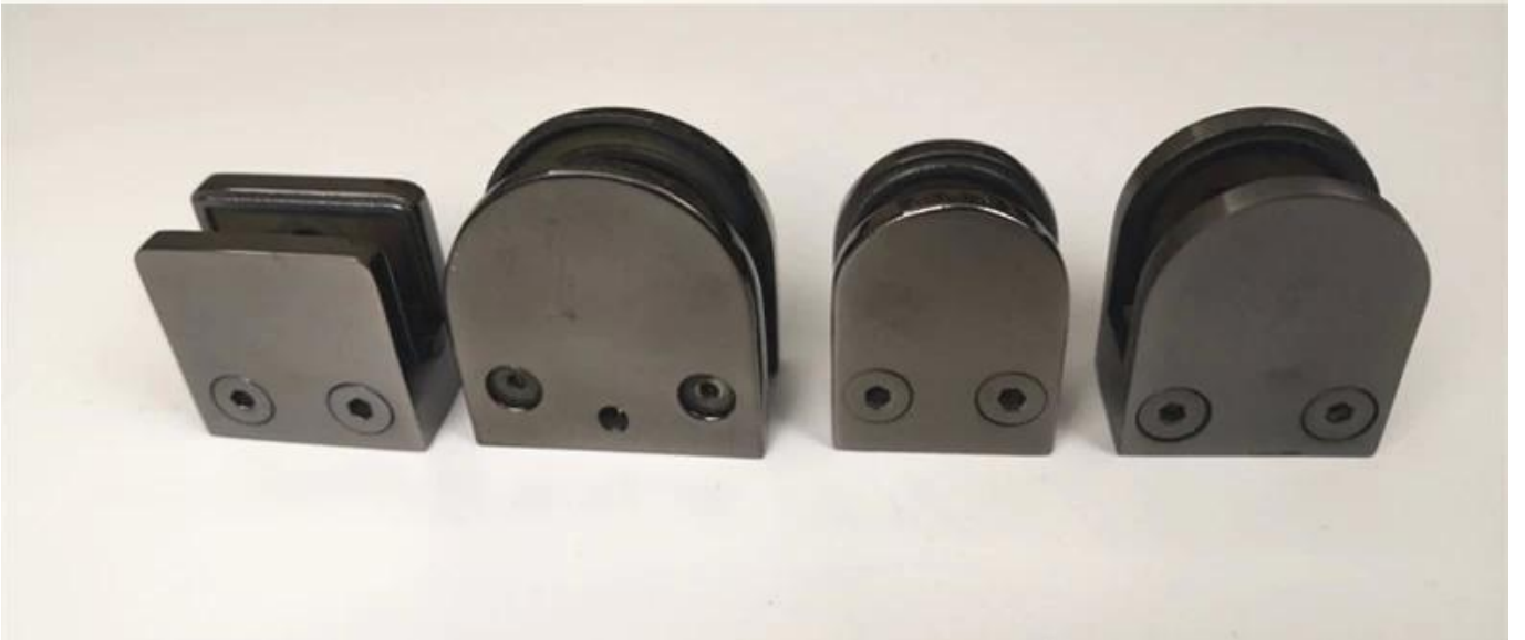
Different types of glass clamps with dimensions: