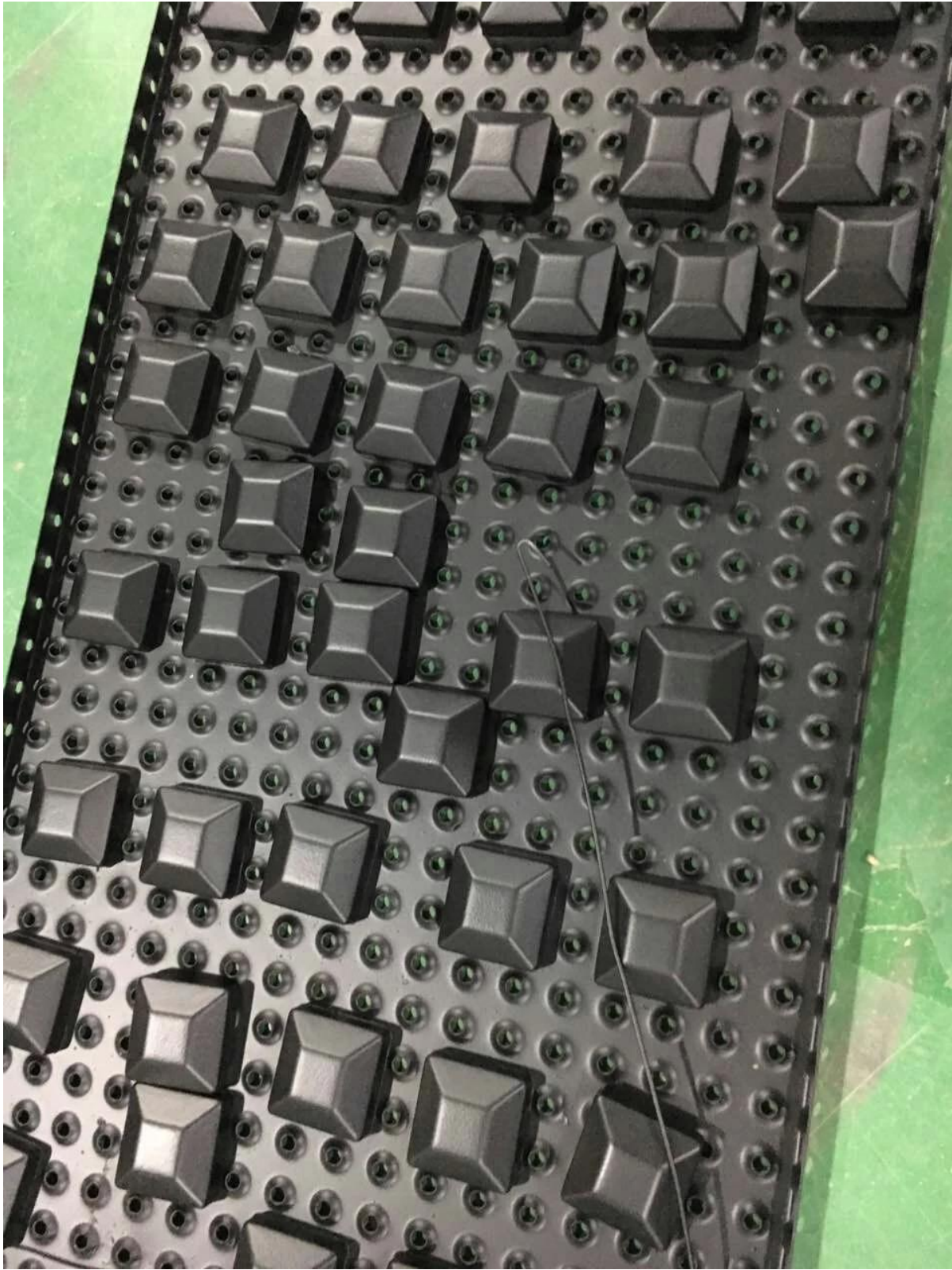
Base plate welding