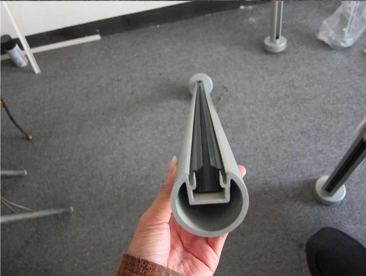
2) Square aluminum handrail