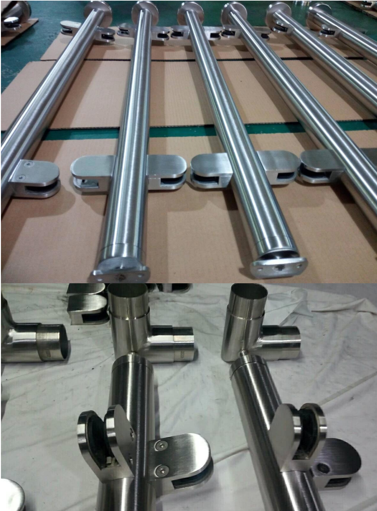
Glass handrail post with end cap on top.