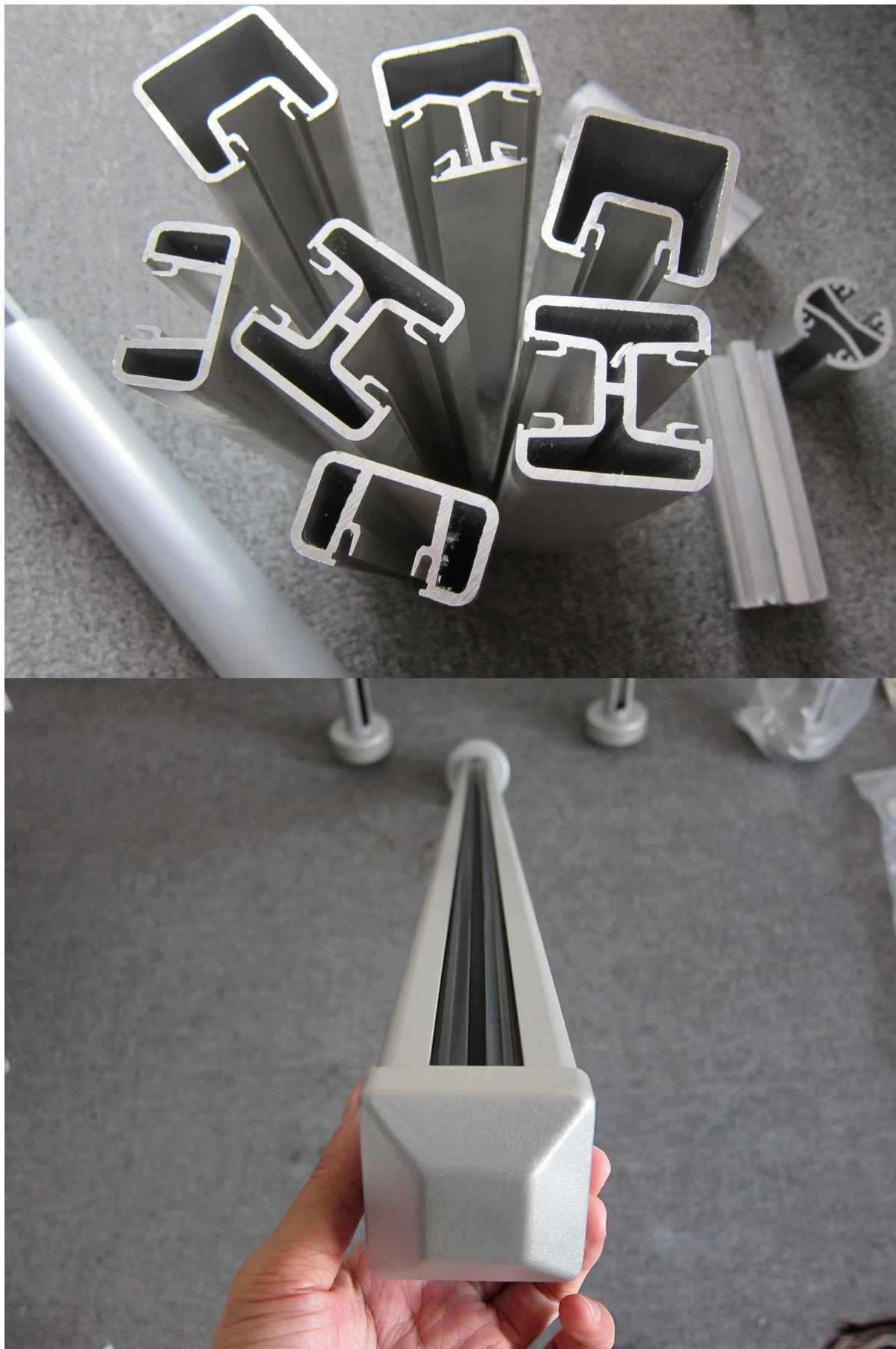
3) Aluminum handrail drawing