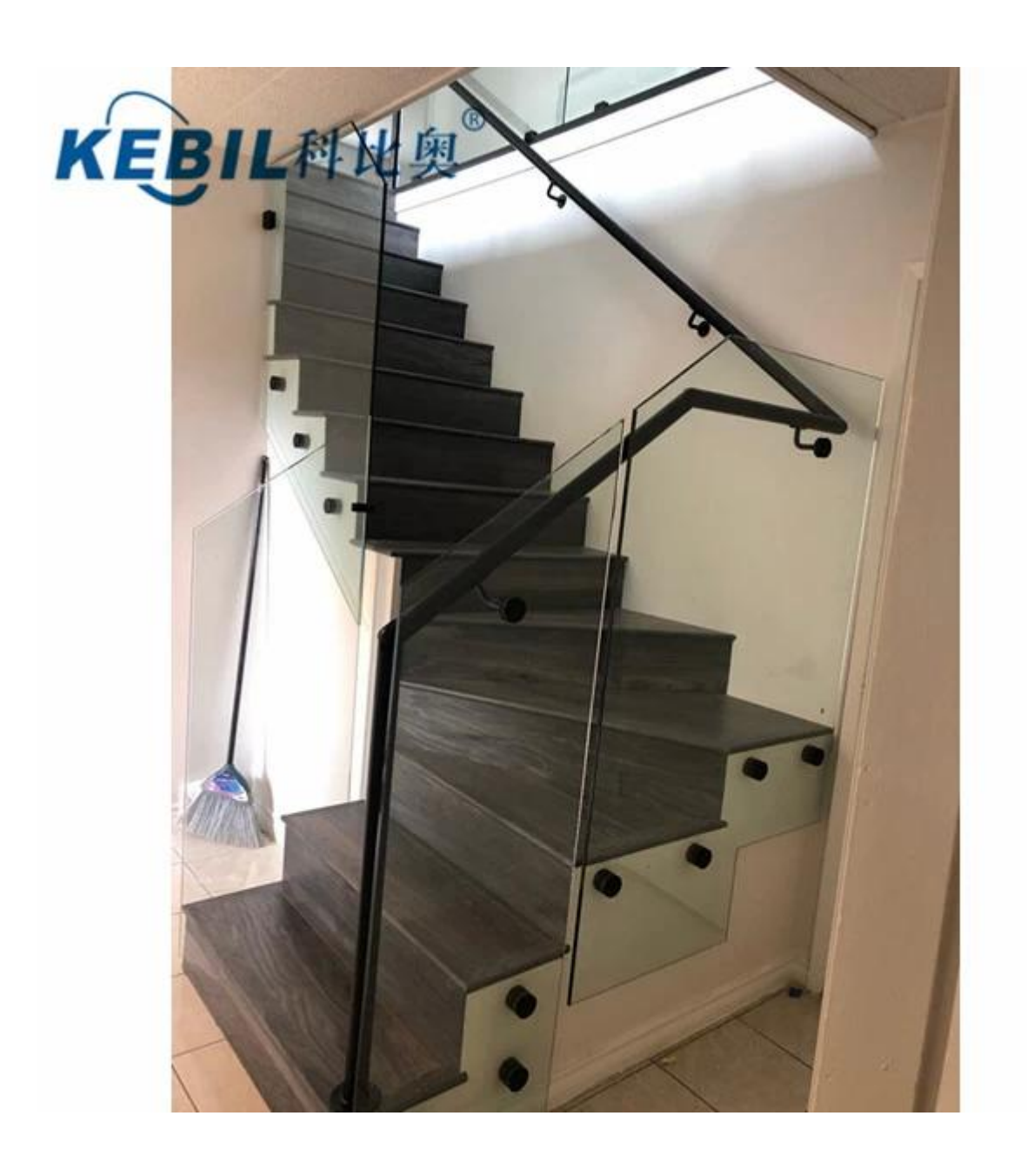
Glass Holder Standoff Bracket Project Photos