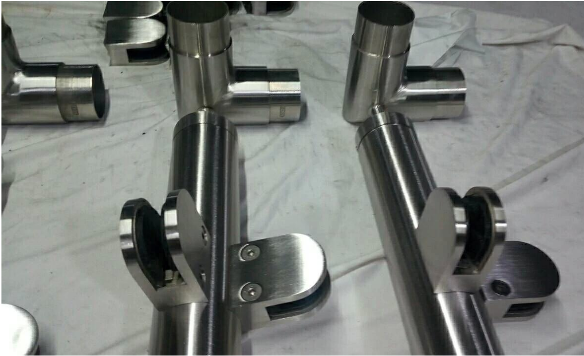
Glass balustrade handrail post with end cap on top.