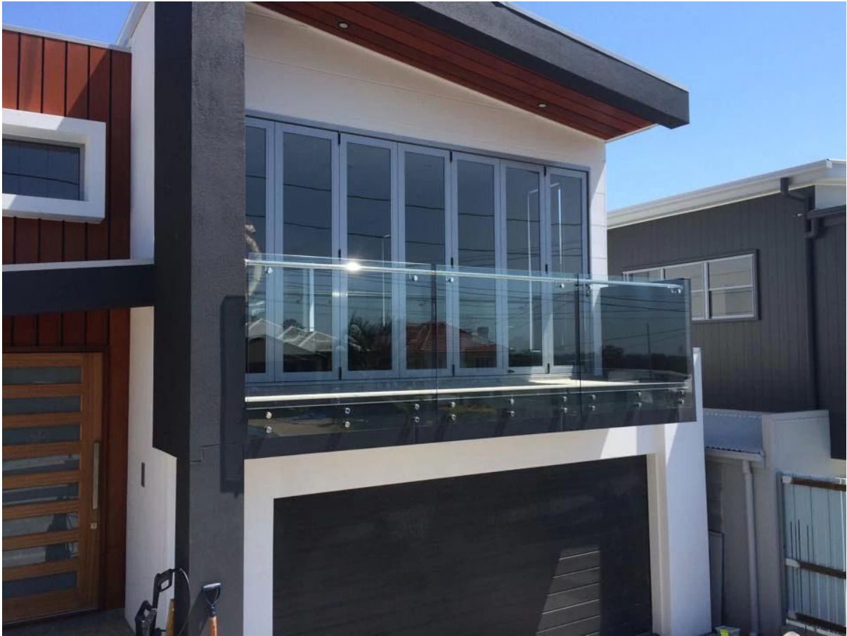
Standoff for stair case railing