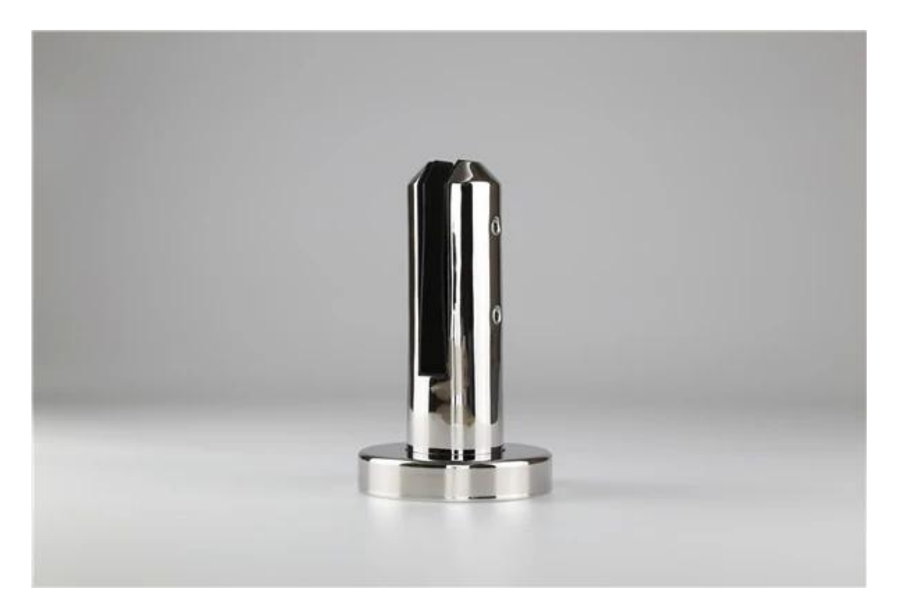
Model No. SCM: Square core drill glass spigot :