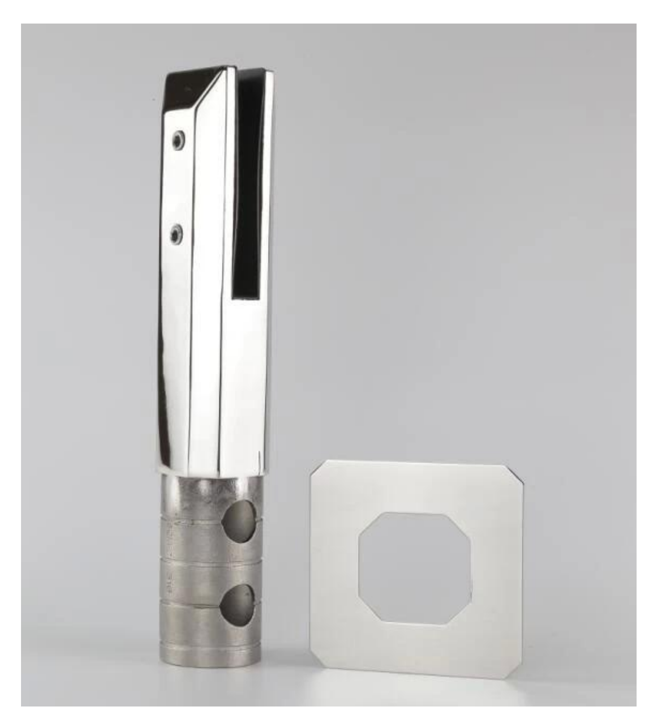
Glasss spigot packaging : 1pc/inner white box, 12pcs/ctn.