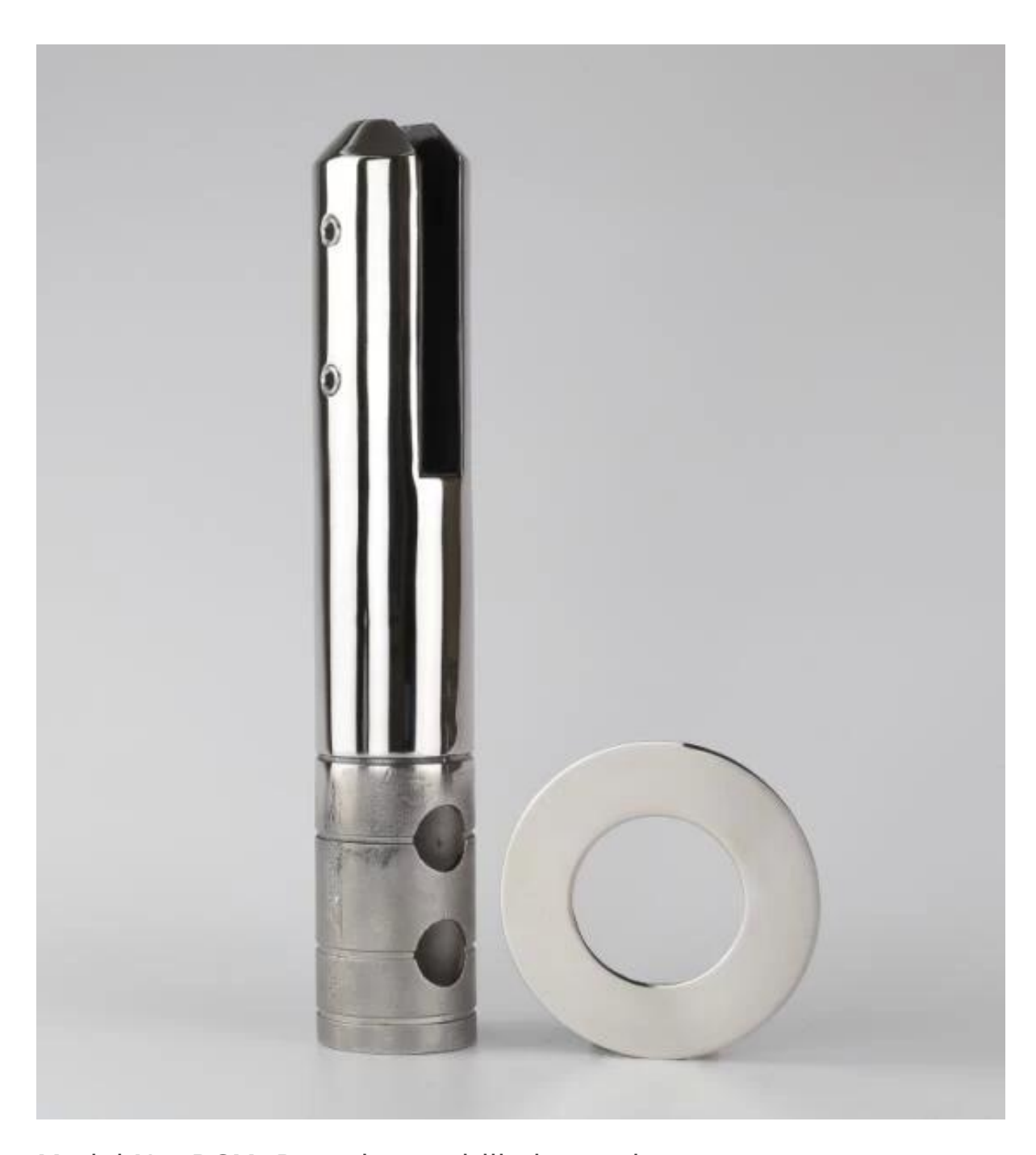
<u>Model No. RCM: Round core drill glass spigot :</u>