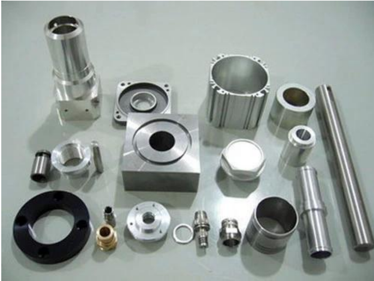
Mass productions custom high quality CNC parts