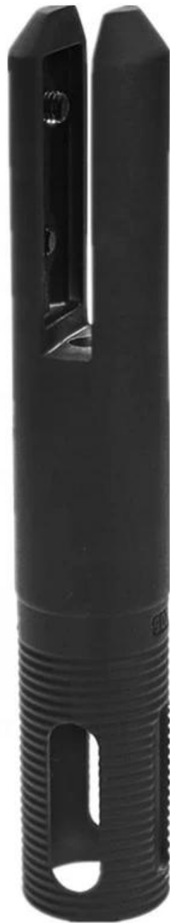
1) Matt Black Core Drill Spigots for Glass Balustrades technical drawing