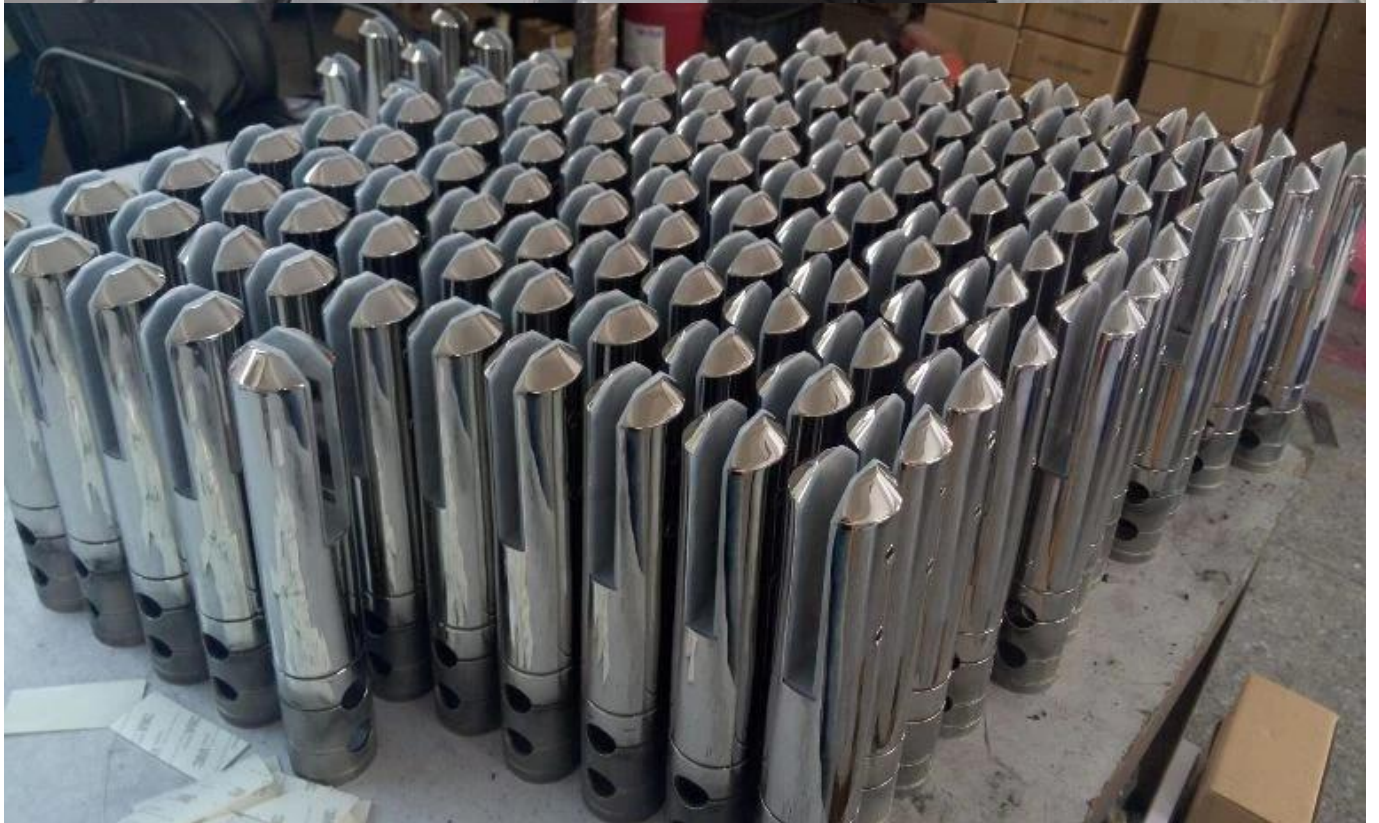
Glass Pool Fence Spigot Safety Packaging