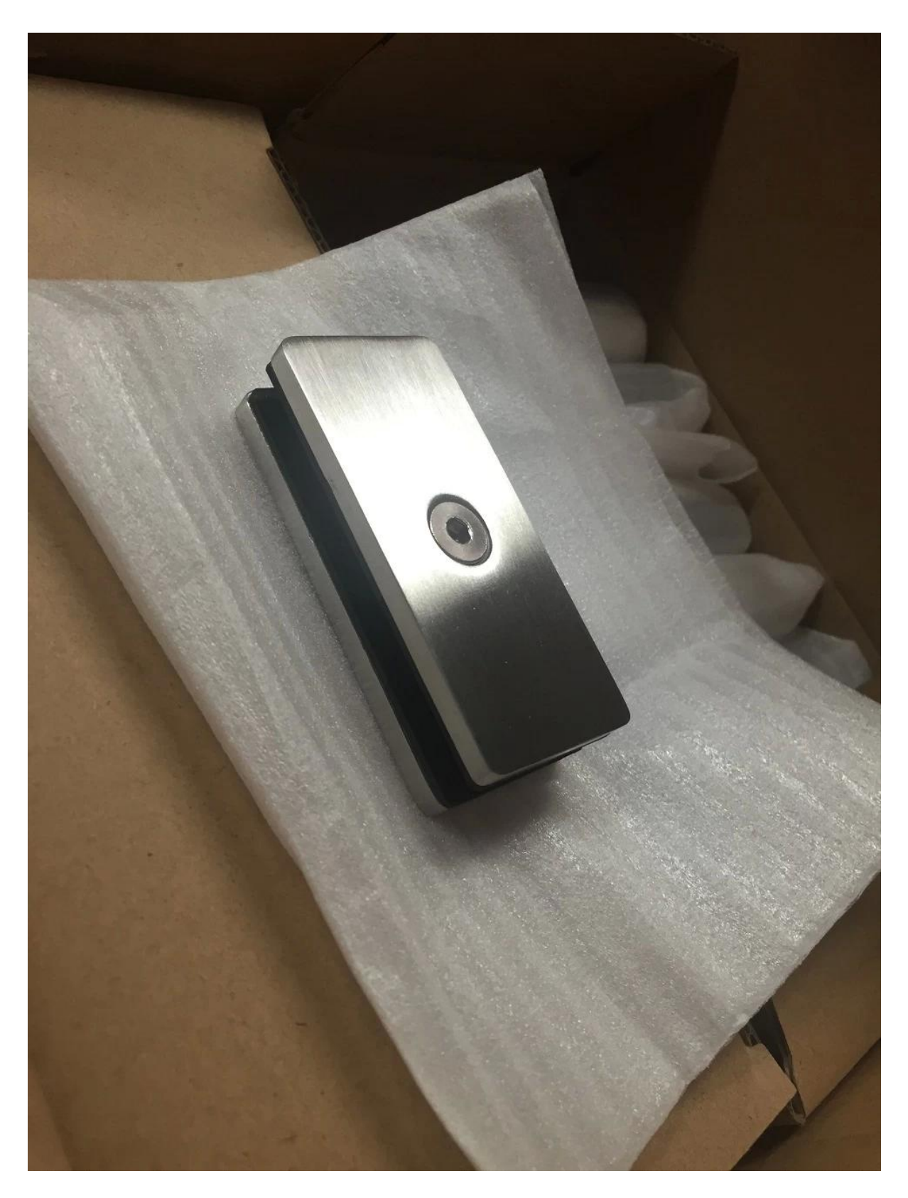
<u>Thanks for your visit, Any interest, please contact with us freely:</u>

Email: sales02@launch-china.cn . Skype: launch-02 .