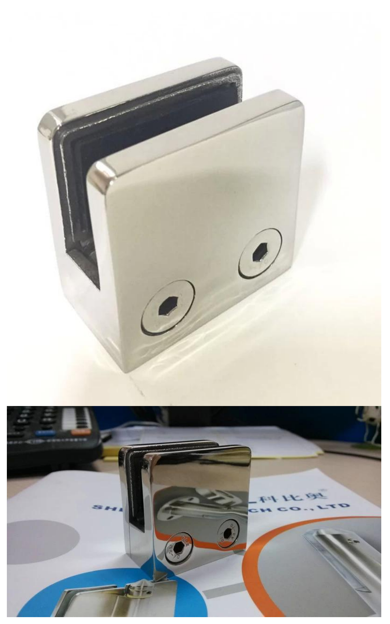
2. Corner 90 degree glass clamp, Model No. CB-90 :