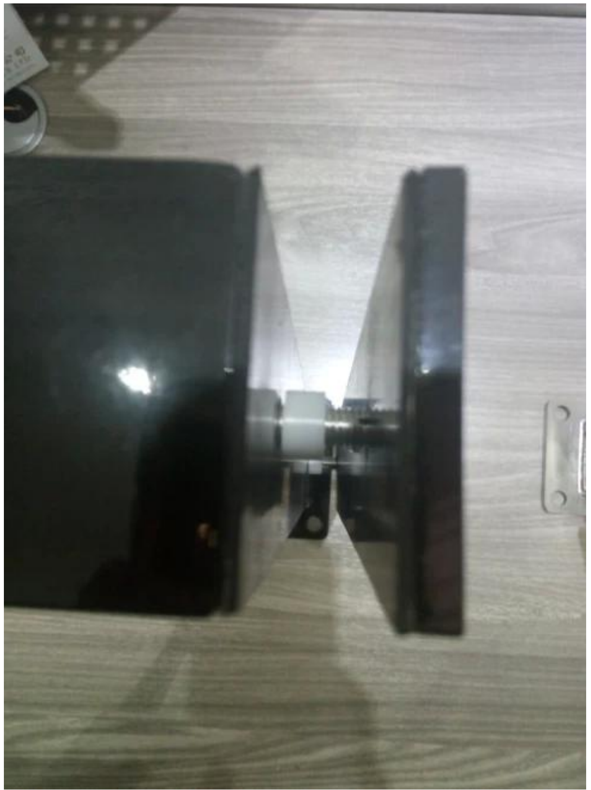
Stainless steel short post