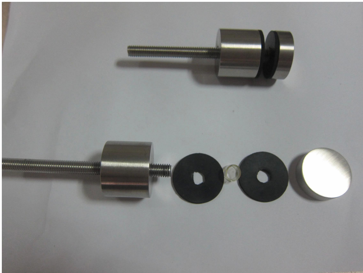
2. Stainless steel glass Standoff SF-50, mounting to concret: